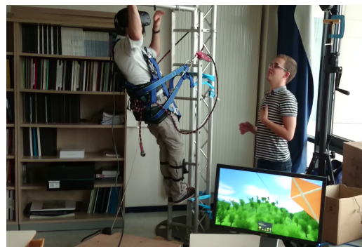
Figure 2: The work-at-height simulator in operation.

We expect our simulator to be deployed in companies dealing with work at height as an additional tool to detect acrophobic persons and thus hire only non-acrophobic workers. Though our simulator meets the first industrial requirements, it is still in development and further functionalities need to be added. Especially we could integrate other sensory cues such as air motion to simulate gusts of wind while at height. As the tasks addressed here are usually performed with live power lines, we could add a haptic feedback when a user touches a virtual power line.