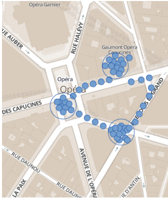
Fig. 3: Three POIs have been extracted from this mobility trace by using a clustering algorithm.

Gambs et al. [12] made an attack on a dataset containing mobility traces of taxi drivers in the San Francisco Bay Area. By finding points where the taxi's GPS sensor was off for a long period of time (e.g. 2 hours), they were able to infer POIs of the drivers. In some cases, they were able to locate a home and even to confirm it by using a satellite view of the area showing the presence of a yellow cab parked in front of the supposed driver's home. It was possible to infer a plausible home in a small neighbourhood for 20 out of 90 mobility traces analysed. Deneau [16] created a visualisation tool to analyse the active and inactive periods of taxi drivers over the day. By correlating their time of inactivity with the five times of prayer per day observed by practising Muslims, it was possible to identify drivers that could be Muslims.