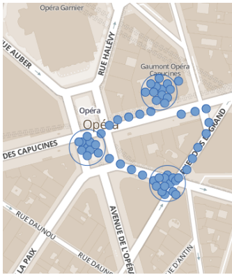
Fig. 3: Three POIs have been extracted from this mobility trace by using a clustering algorithm.

Gambs et al. [12] made an attack on a dataset containing mobility traces of taxi drivers in the San Francisco Bay Area. By finding points where the taxi's GPS sensor was off for a long period of time (e.g. 2 hours), they were able to infer POIs of the drivers. In some cases, they were able to locate a home and even to confirm it by using a satellite view of the area showing the presence of a yellow cab parked in front of the supposed driver's home. It was possible to infer a plausible home in a small neighbourhood for 20 out of 90 mobility traces analysed. Deneau [16] created a visualisation tool to analyse the active and inactive periods of taxi drivers over the day. By correlating their time of inactivity with the five times of prayer per day observed by practising Muslims, it was possible to identify drivers that could be Muslims.