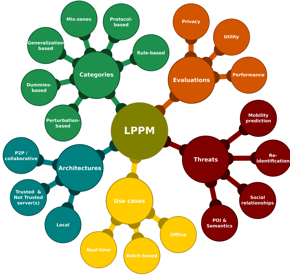
Fig. 2: Our survey reviews practical threats associated with location disclosure and surveys state-of-the-art LPPMs over different use cases (i.e., protecting data in real-time, operating by batches, or offline). LPPMs are structured in six categories and can adopt different architectures. We also detail their evaluation in terms of privacy and utility, as well as performance.