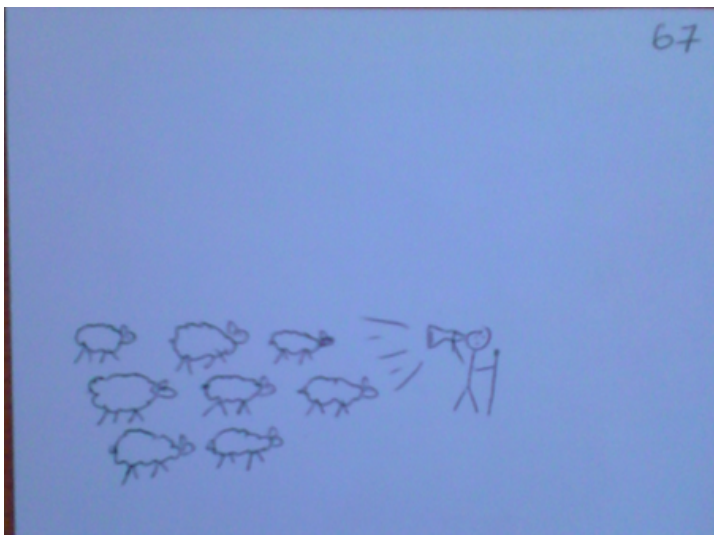
Fig 4. cSquare 67 depicting "shepherd-flock" or opinion leader phenomenon

The story then concluded by recalling the three ingredients deemed fundamental for a successful communication campaign: choosing one's target, defining one's objectives and choosing the adequate means to get the message across as effectively as possible.