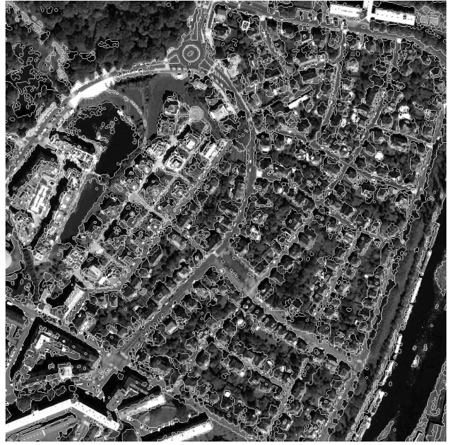
Fig. 1. The segmented image (900 × 900 pixels, resolution: 0.7m per pixel).

The method computes \mathcal{L}_i for each cluster C_i and then assigns the concept \mathcal{K}_i^{max} to the unknown regions of C_i .