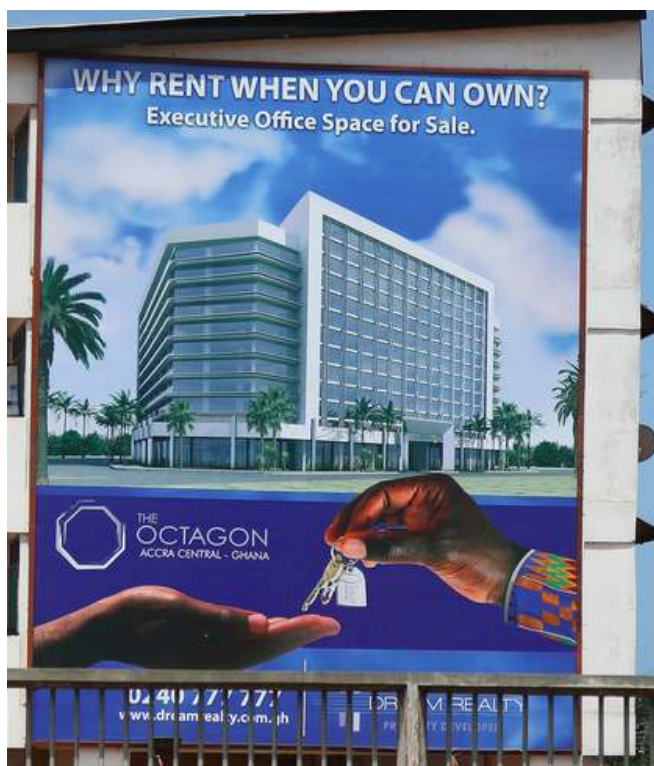
Picture 1. The Octagon complex at the heart of the CBD: entrepreneurial urbanism and eviction of street traders