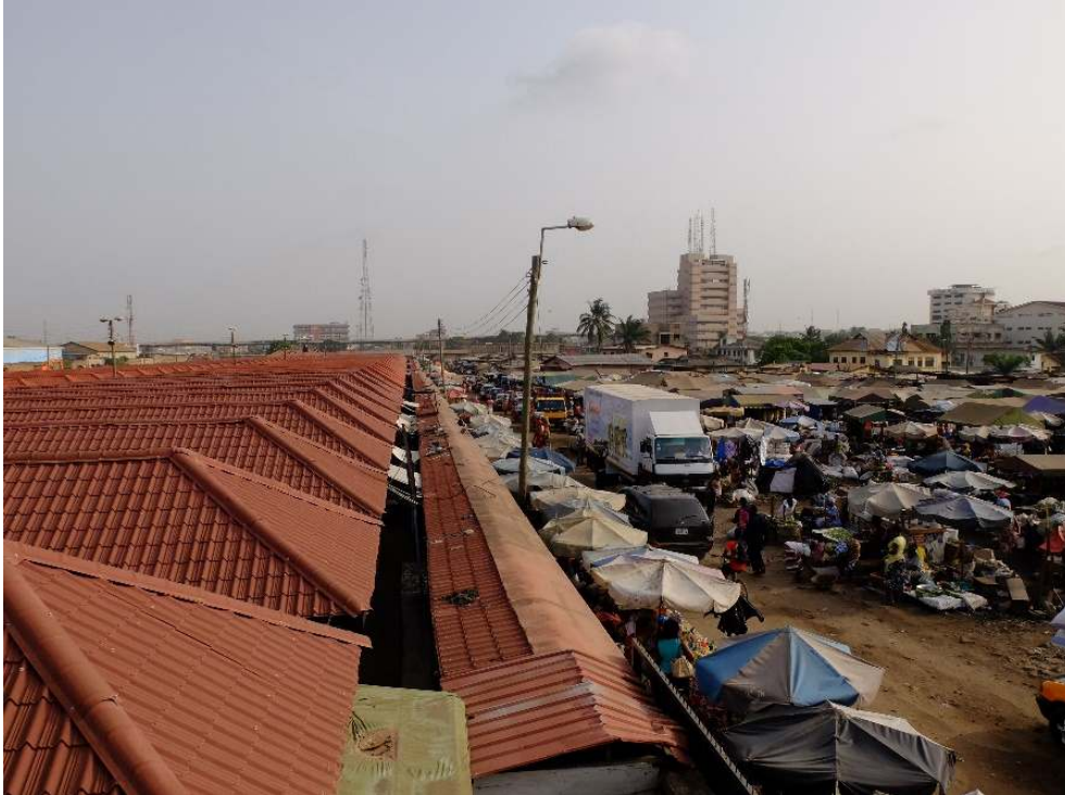
Pictures 2a and 2b. Pedestrian Mall and Odorna Market: a “new” decrepit infrastructure

temporary structure so that vendors could have been given a choice in the design of a permanent and modern structure.