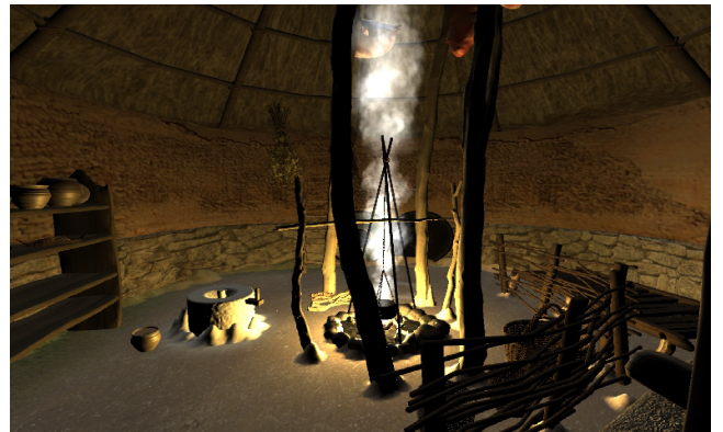
Figure 7: Storage context in the domestic environment of a round hut

The interaction here happens when the user pours the content of the urn (some kind of grains or seeds, such as oats, rye, millet, spelt wheat, emmer wheat, barley and einkhorn wheat that were cultivated in the Iron Age) into the cauldron on the fire in order to make food. The user can also interact with a rotary quern