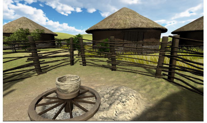
Figure 6: Manufacturing context with potter's wheel outside of a round hut

for this project was optimised. To create the different visual assets, we used a variety of sources and resources: