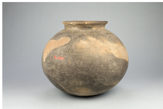
Figure 2: Late Iron Age funerary urn from Saltdean, Sussex (UK)

The urn is an important artefact of the collection of the museum, as it reveals important information about the life of local communities in the late Iron Age in the south east part of Britain before the arrival of the Romans. Even though there are no signs of a big agricultural settlement in the area (larger settlements have been found at the Hollingbury Hill Fort, Devil’s Dyke Hill Fort, Kempton, Newhaven and Coldean; all close to Brighton), the urn and its contents indicate that some small agricultural and farming communities might have lived in Saltdean in late Iron Age. Such community could have been built near the white chalk cliffs overlooking the sea.