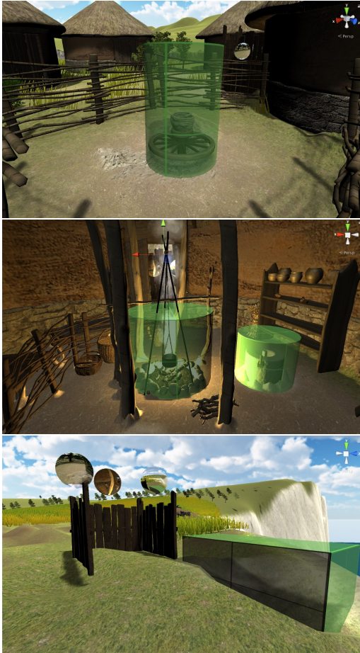
Figure 11: Colliders used to trigger interactivity within the different contexts