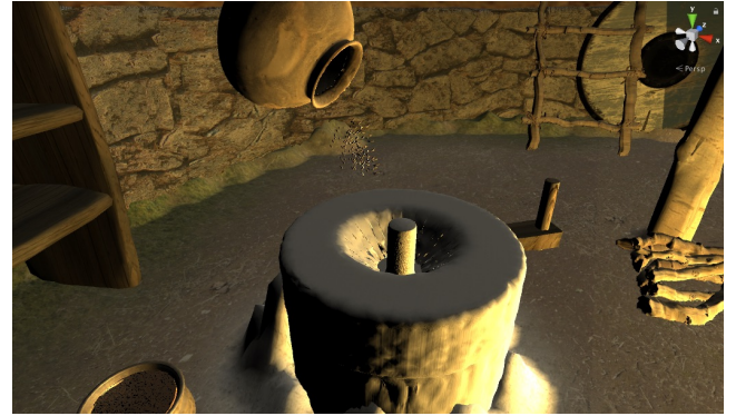
Figure 12: Falling seeds from the pot into the rotary quern

Very often, similar projects on cultural heritage are driven by archaeologists, curators or historians and implemented by private companies. In this case, all the digital 3D assets and code remain generally the property of the private company and further evolutions must be negotiated. The cost of a VR system in the context of a museum can arise. However, this must be compared with a physical reconstruction of sites. These sites are very difficult and costly to maintain because of the construction techniques used. In addition physical reconstructions are subject to security constraints such as the addition of emergency exits, security and accessibility equipments that undermine the authenticity of the reconstitution.