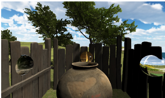
Figure 9: User initial view within the VR environment: three floating spheres representing the three contexts to visit

The user starts the experience wearing the headset and handling the tracked copy of the pot. He/she is first positioned in front of an empty scene with three floating spheres representing the three contexts to visit (see Figure 9) and has the virtual pot visible in his/her hands (see Figure 10). To access one context, the user touches the corresponding sphere with the pot and is teleported instantly to the context. Once in a context, the user can naturally