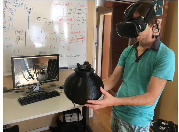
Figure 10: Testing the 3D printed urn with tracker interactions

sion of Unity used is "Unity 2018.1.6f1" for development. Testing was done on a PC DELL PRECISION 5820 Intel Xeon W-2104 (4 cores, 3,2 Ghz, 8,25M cache), 16Gb DDR4 2666 MHz, SSD 256Go 2'5 SATA, Graphic card Nvidia Geforce GTX 1080 8GB, running Windows 10, an HTC VIVE and one HTC tracker. The application contains a 500Mb 3D scene size. The performances were about 50 Frames Per Seconds but should be improved with textures optimization and baked lighting.