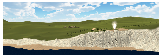
Figure 4: Terrain 3D model of the landscape with the settlement and burial site displayed

Trees, grass and fields were added in coherence with the historical aspect. However, we acknowledge that the VR landscape might not be exactly the same as the landscape in Iron Age. Nevertheless, the area with the sea cliffs, hills and deforestation is the closest that we could have to the Iron Age landscape. Hence, it has been used to provide the best possible representation with some compromise.