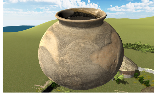
Figure 3: 3D model of the funerary urn with texture as shown in the VR environment

The model of the pot was then 3D printed in full-size (see Figure 10) on a Raise3D N2 Dual Plus owned by the computer science research institute. This 3D printer is able to print a volume