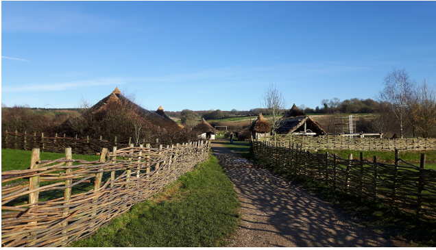
Figure 1: Buster Farm, Sussex (UK)

potential to immerse spectators in environments which have a spatio-temporal dimension.