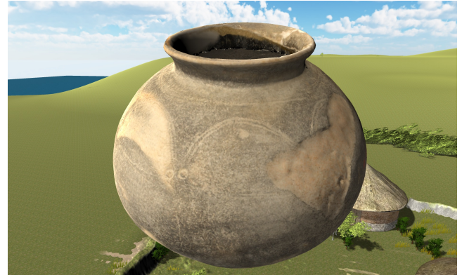
Figure 3: 3D model of the funerary urn with texture as shown in the VR environment

The model of the pot was then 3D printed in full-size (see Figure 10) on a Raise3D N2 Dual Plus owned by the computer science research institute. This 3D printer is able to print a volume