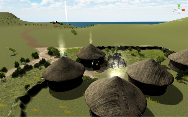
Figure 5: 3D environment of Iron age settlement close to Salt-dean's cliffs