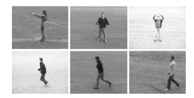
Fig. 6. Actions of the KTH dataset

scenarios of illumination, appearance and scale change. The dataset contains 2391 video sequences with resolution of 160 120 pixels. Actions of KTH data set are shown in Fig.6.