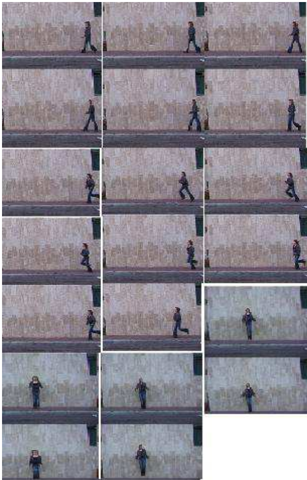
Figure 2. Example of sequences containing human practicing three successive actions: Walk, Run and jack

Illustrative example of concatenated videos is shown in Figure 2. We use the subtraction method described in [10] to obtain moving object silhouettes (silhouette tunnels). Then, we aligned the centroid of individual 2D silhouettes to compensate global object displacements. Precision of detected action boundaries depends on the length of action segments and pose descriptor precision. Clearly, a good descriptor of silhouette poses and a large segment length reduce the uncertainty of action boundary location. We applied our action change detection algorithm using 30 frames for a training set. A careful choice of training set frames number is essential for the performance of our algorithm.