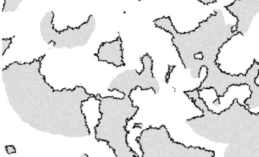
Fig. 1. Example of the high-level structures (traveling waves) created by the interaction between producers (gray) and cheaters (black). The producers form an expanding front that colonizes free space. The cheaters follow common good gradient, hence the front, thereby leading to the extinction of the wave. This frees space that hence become available for another wave. This interaction between front expansion and space freeing results in a stable high-level spatial temporal dynamics which enables evolution of high production common good despite high cost to individuals (reproduced from [9]).

waves is not encoded in the genome of the organisms. It is rather encoded in the dynamic eco-evolutionary interactions between producers and cheaters, i.e. at a higher organization level.