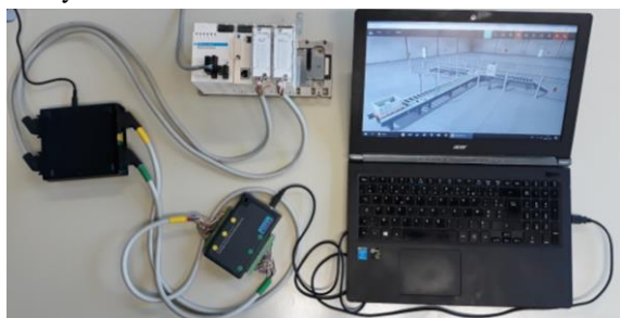
Figure 4: Experimental platform with M340 PLC, FACTORY I/O and USB DAQ Advantech 4750.

controller, the maximum Hamming distance is 2, and the time to execute the SAT solver algorithm is always less than 1 ms.