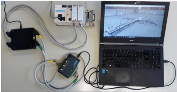
Figure 4: Experimental platform with M340 PLC, FACTORY I/O and USB DAQ Advantech 4750.

controller, the maximum Hamming distance is 2, and the time to execute the SAT solver algorithm is always less than 1 ms.