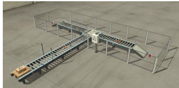
Figure 3: Sorting system from FACTORY I/O.

FACTORY I/O ( https://factoryio.com/ ) is a new generation of 3D factory simulation for learning automation technologies. It integrates most of the features described in the paper “Virtual systems to train and assist control applications in future factories” (Riera and Vigario, 2013). Designed to be easy to use, it allows to quickly build a virtual factory using a selection of common industrial parts. FACTORY I/O also includes many scenes inspired by typical industrial applications ranging from beginner to advanced difficulty levels. We propose in this paper to use the same benchmark as in the previous paper (Pichard et al., 2016): the sorting system. The main goal of the “sorting system” is to transport and sort cardboard boxes by height using a turntable (Figure 3).