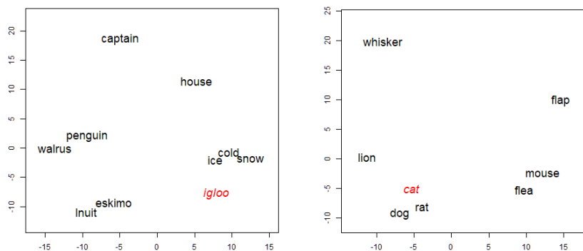
Figure 2: PCA maps of the responses to the stimuli (in red) “igloo” (left) and “cat” (right), based on word embeddings -- manual translation to English

The results for cat are more self-explanatory, with the interesting case of mouse which is not considered as a close co-hyponym (as are dog , rat and lion ) but more as an association because of the “cat and mouse” topoi.