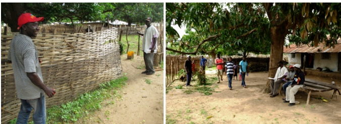
Figures 2 and 3. Albreda: Walk in the village to hunt for clever architectural and landscape features.

The first step was to inventory the existing architectural typologies, techniques and materials available. To do so, field trips were organised with the participation of key stakeholders, not by the architects alone. In Albreda-Juffureh for example, a two-days participatory workshop gathering 40 people including masons, carpenters, guides and civil servants was organised. Participants were introduced to sustainable architecture principles and then split into 3 groups to hunt for clever details still available in the village (Figs. 2 and 3). One group was focussing on walls, another on roofs and the third on details and comfortable atmospheres. They spent a whole afternoon observing details and taking pictures on the field, and on the second day each group presented a selection of images and ideas that could be integrated in the information centre. Thanks to intensive group discussions, by the end of the workshop solid foundations for the architectural concept were compiled, and the architects involved had enough material to finalise the drawings.