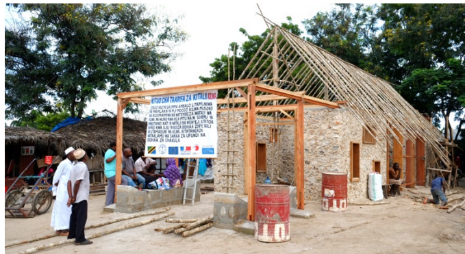
Figure 8: Information panel in Swahili installed in front of Kilwa Information Centre during construction. The site was open to visitors.

From the very first day of the construction, some information panels were installed at the construction sites to inform locals and visitors about the nature and architectural features of the building. This allowed everyone to understand the purpose of the projects and helped exchange opinions (Fig. 8). It is also remarkable to mention that in Albreda, fishermen and women who work near the building as well as some tourist guides, who actually form part of the principal future users of the building, participated in its construction on a voluntary basis.