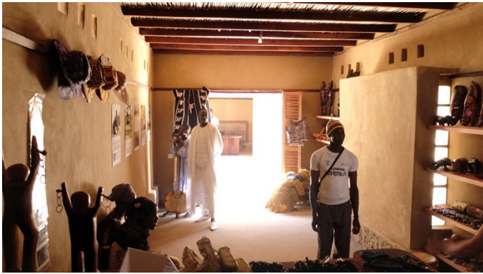
Figure 14: Selling of local Arts and craft products in Albreda Information Centre.

In addition, both projects integrate spaces dedicated to the sale of local craft products that ensure fair trade and avoid the exploitation of endangered natural resources (Fig. 14).