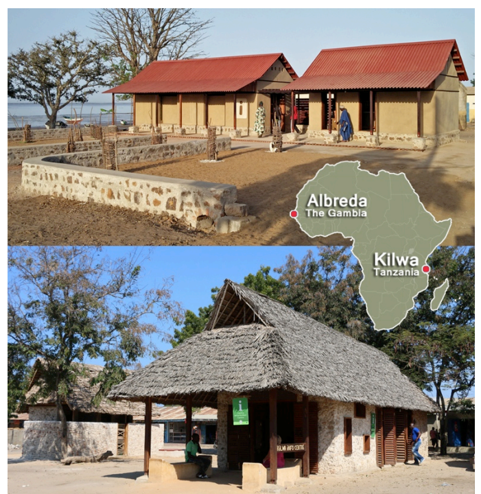
Figure 1. Location of Albreda and Kilwa information centres.

lutions. Results are greatly adapted to particular means, needs or desires. Analysing the vernacular culture of a place to reinterpret it in the contemporary context has proven to be a solid method to create more sustainable buildings.