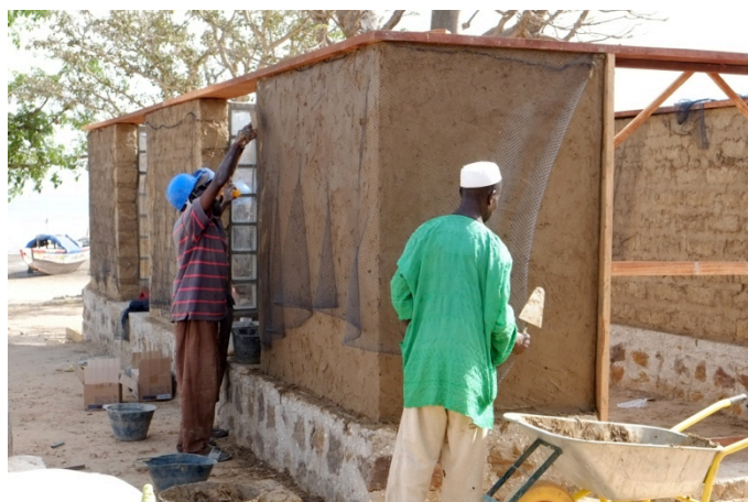
Figure 9: Fishing net to reinforce lack of clay in the soil

Significant green gas emissions arise from the transportation of building materials from the production plants to the construction sites. To avoid CO 2 emissions, materials were sourced as much as possible in the villages, where much of the transportation was done with donkey carts (Albreda) or sailing boats (Kilwa and Albreda). In order to decrease embodied energy rates, the use of imported industrial materials was deliberately reduced to a minimum, and mainly where no equivalent materials were available in the village, such as electricity or plumbing fittings. In Albreda, for example, the soil lacks clay. Instead of replacing the adobes with cement blocks, the earth plastering was reinforced with fishing nets to increase its tensile strength (Fig. 9), and with lime to improve its resistance against rainwater. The use of cement was limited to slabs. The same occurred in Kilwa, with the exception of cement that was also used for foundations because time was a limiting factor and cement blocks were available. However, in this case transport was not much increased as cement is directly produced in Kilwa.