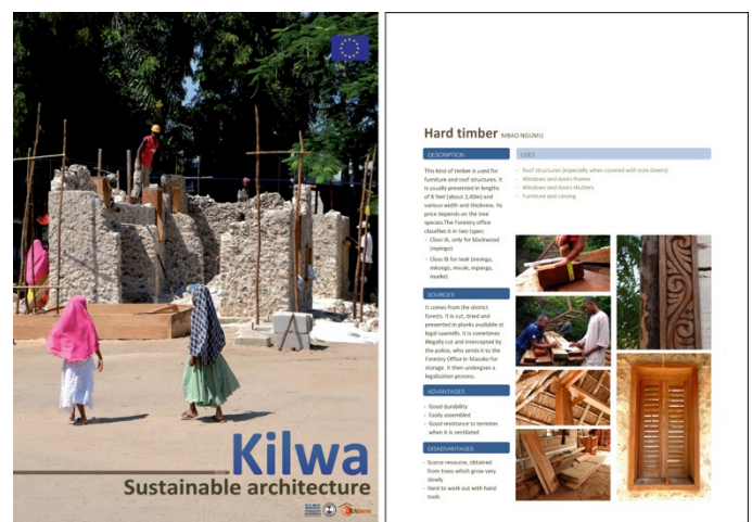
Figures 15 and 16: Kilwa Sustainable architecture publication.

A document entitled Sustainable Architecture in Kilwa was published after the project (Figs 15 and 16). It describes the construction process of the information centre, and presents information sheets on the fourteen local materials available in town, their uses and advantages. It aims to raise awareness on sustainable development and inspire other builders, either from the private or the public sector.