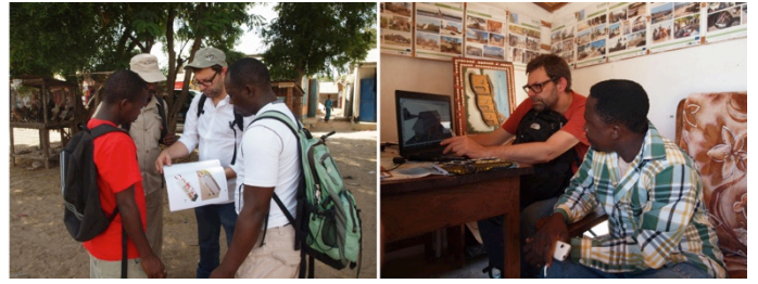
Figures 4 and 5. Kilwa: Discussing details on site with future users and using a 3D software to design with craftsmen.

gestion, as if the contributors were drawing themselves (Fig. 5). The final design showcases the collective intelligence of 15 people.