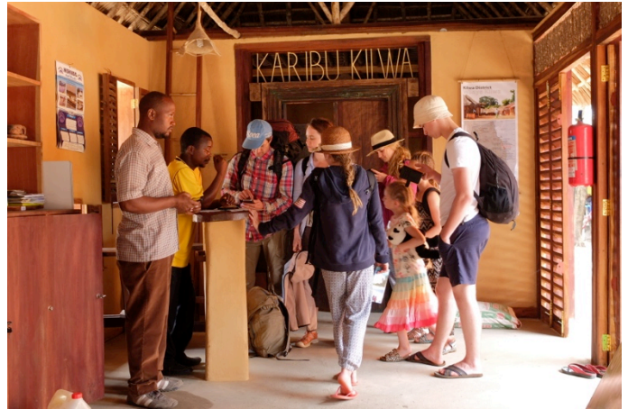
Figure 12: Kilwa tour guides promoting their heritage resources to visitors in the information centre.

tion Plans. The main objective of both projects was to develop a "sustainable tourism product" encouraging more visitors to stay longer and therefore increase benefits to the population. For that, the Action Plans focused on the inventory and promotion of all heritage resources available aside from those inscribed on the World Heritage List. As avowed in the Ngorongoro Declaration, the idea is that when local populations are directly employed for the promotion of their natural and cultural heritage, they would be the first ones willing to protect and preserve it (Fig. 12).