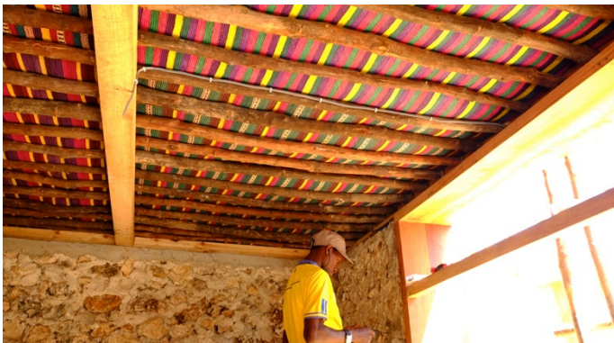
Figure 10: Use of locally woven mats as ceiling boards in the guides' office in Kilwa Information Centre.

The use of iron sheets to cover the Albreda Information Centre is justified considering that they have been recycled from the old warehouse building, which had to be demolished because it was incongruous and was under serious risk of collapse. In addition, the low insulating capacity of metal roofs was improved by installing a traditional ceiling system consisting of one layer of raffia sticks covered with a cotton cloth and a thick earth layer (Fig. 11). Some ventilation holes located below the ceiling help release the excess of hot air. Many more ventilation holes were inserted in the adobe walls, already well known for their good hydrothermal behaviour. Both elements, earth blocks and ventilation holes, are features of the traditional architecture and work well to preserve users' health. Vernacular houses also have a veranda to protect people and the building itself from weather severity, either against excessive sun radiation or strong rains. Finally, both buildings left no construction waste behind because all materials were used in one way or another.