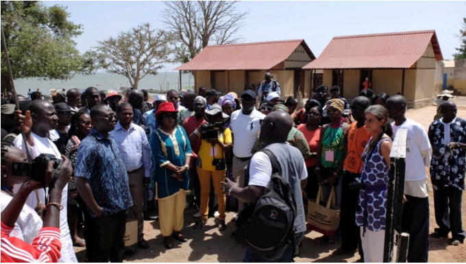
Figure 17: Ministers and Directors visiting Albreda Information Centre during the 2016 Roots festival.

to build their own houses in the capital city Banjul with the same materials. They have presented the information centre as a living museum within the Roots Festival (Fig. 17), and published two articles where the Ministry describes some features and advantages of building this way.