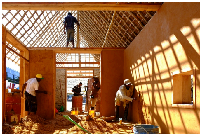
Figure 6: Kilwa Information Centre under construction.

Also the finishing and furnishing of Kilwa Information Centre was done a few months after completing the structural works. This allowed users to more clearly define their needs and so the building enjoyed a more accurate completion.