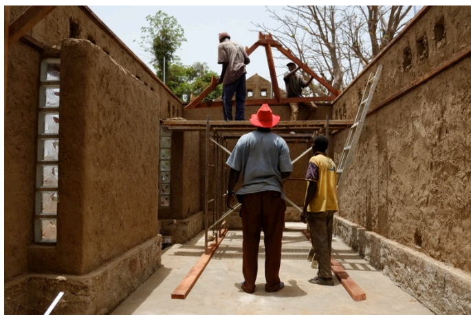
Figure 7: Albreda Information Centre under construction.