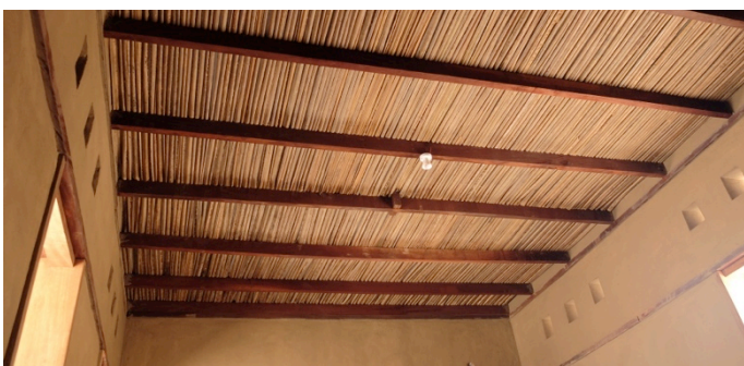
Figure 11: Wood-raffia-earth ceiling blocking the radiating heat of the roof in Albreda Information Centre. Ventilation holes were left in the adobe wall below and above the ceiling.