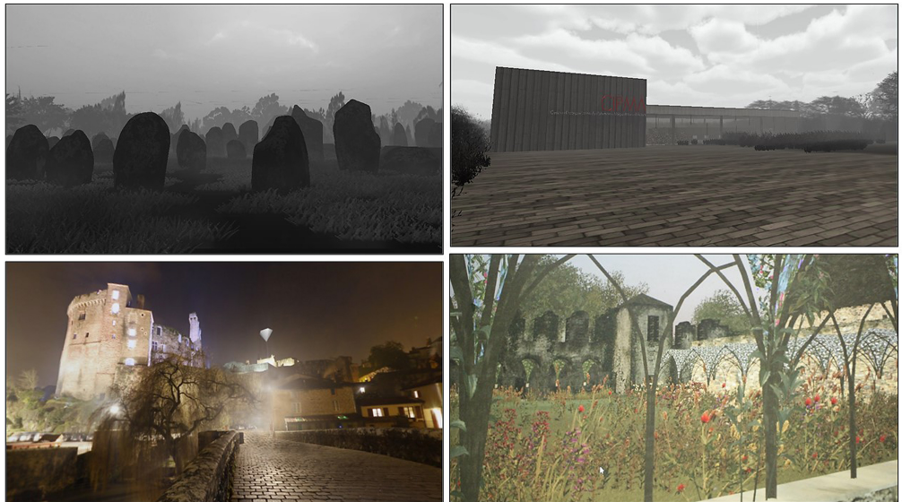
Figure 5 Real time visits using Unity 3D

Paradoxically, the first effect that was generated was the return to the analogue, within a continuum that goes from sketch to 3D model, then to 3D printing or building, then a return to the digital with 3D scan (with photogrammetry, for example) for adjustments and reworks that can feed the loop some more. The questions are thus moving from a series of tools to design, finalise and build, to the development of processes, of a set of bridges enabling the succession of tasks, analogue and digital, while preserving the information's integrity. The expertise is now in the ability to articulate and preserve the coherent implementation of this process. One of the