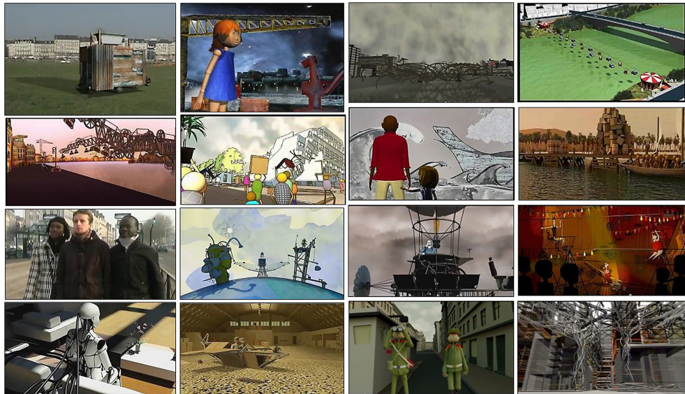
Figure 1 Extracts from student's CG films.

Lastly, the third criticism put forward since the dawn of the digital turn, at the beginning of the 21st century, could be organised around the concept of correspondence . This concept has many ramifications: we can first mention the question of generation of form and correspondences between real and virtual. The ancient paper architecture, naturally associated with names such as Piranesi or Boullée, is followed by digital architecture (Spiller 2007; 2008), whose first virtuality questions the challenges