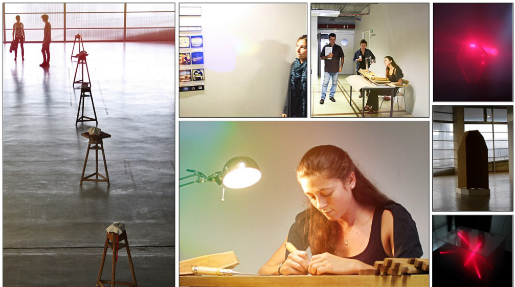
Figure 2 Conceptual work leading to storytelling

This transgression is perhaps the result of the method that is proposed to students. Starting from a situation in which History is very strong in a location, we asked them to invent a dramatic situation, whose resolution is solely dependent on the transformation of space, whether through an urban or an architectural project. This dramatic situation becomes the subject of CG short movies. First, the students