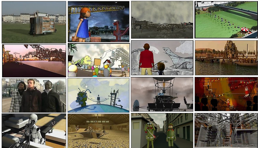
Figure 1 Extracts from student's CG films.

Lastly, the third criticism put forward since the dawn of the digital turn, at the beginning of the 21st century, could be organised around the concept of correspondence . This concept has many ramifications: we can first mention the question of generation of form and correspondences between real and virtual. The ancient paper architecture, naturally associated with names such as Piranesi or Boullée, is followed by digital architecture (Spiller 2007; 2008), whose first virtuality questions the challenges