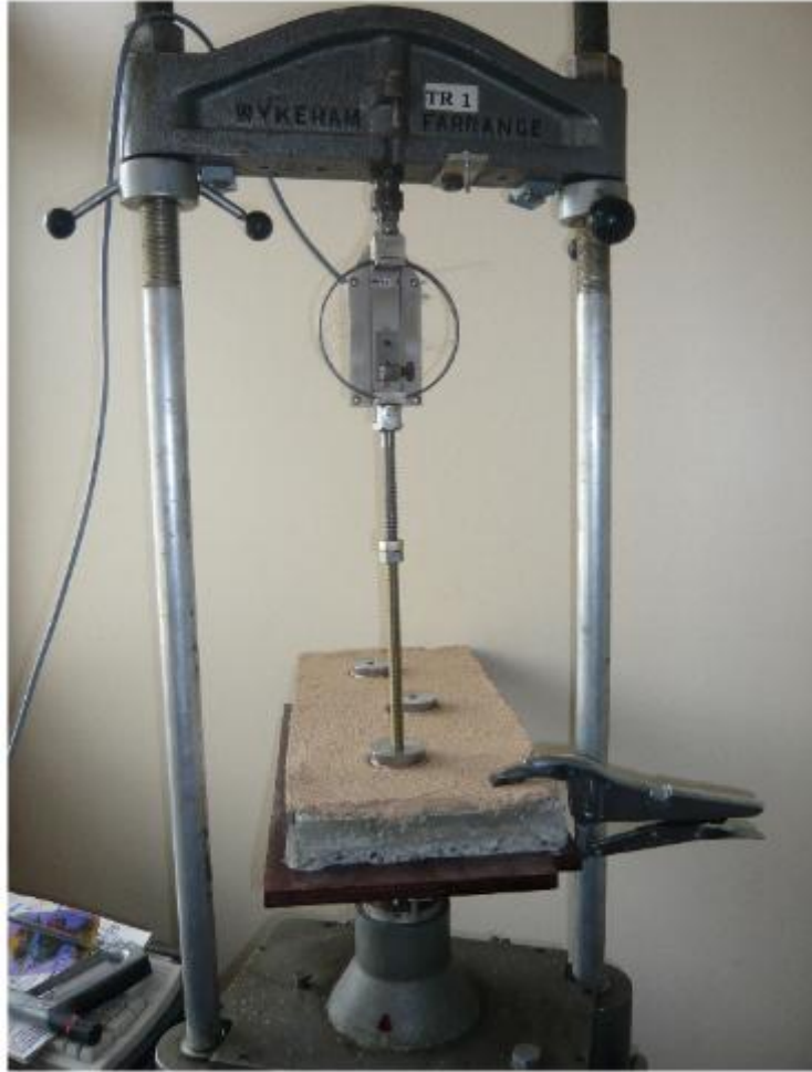
Figure 2: Tensile strength tester used for adhesive strength test