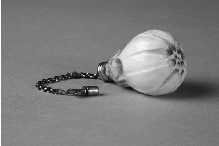
Fig. 2. Scent bottle of soft paste porcelain in the shape of a closed flower, Chelsea Manufactory, c.1755–1758, inv. 1199–1864

engineering and design possibilities that came with the development of new hinges, sliding and screwing mechanisms that made them foldable and small enough to fit into a pocket. 17 [Fig. 2] Although the clever contraptions were targeted at male and female consumers alike, in discourses at least they were often seen as a trope for female vanity. In The Female Spectator in 1745, Eliza Eliza Haywood writes: