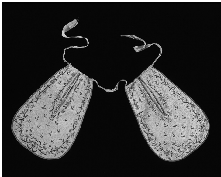
Fig. 1. Pair of linen pockets, 1700–1725, inv. T.281A–1910

The list of near-on 15 objects all carried in the pocket by the well-to-do woman illustrates the host of pocket-sized objects which the eighteenth-century consumer society produced specifically for the pocket. In an age of expanding consumption, the small space of the pocket was commodified. Useful contraptions shrunk in size by the engineering spirit of an industrial age were repeatedly marketed in contemporary advertising as pocket-sized, commodious, or portable. 2 These consumer goods were not entirely a female specificity of course and men had their fair share of natty contraptions in their own pockets. 3 But whilst men had had pockets integrated to their garments since at least the sixteenth century in the west, women did not usually have pockets in their dress. 4 Between the end of the seventeenth century and the end of the nineteenth century, women's pockets were discrete articles of clothing rather like bags that tied around the waist under the dress and were accessed through an opening in the side of the petticoat or skirt. So that when the woman on Barnes' common was attacked the thief made away not just with the contents of her pockets but with the actual pair of pockets that she had been wearing under her petticoat. [Fig. 1]