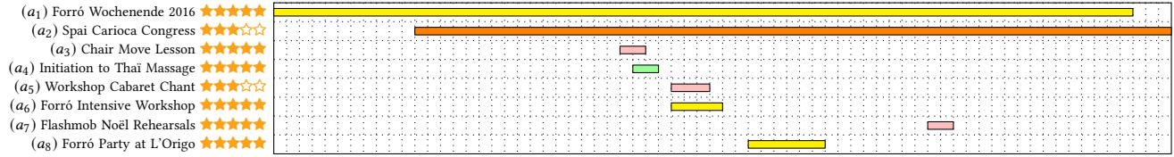
Figure 1: A choice of activities for a weekend during the time frame 1 December 21:00 - 5 December 01:00 (time windows of their availability). The bar colours indicate categories of activities: yellow - <Dance →Forró>, orange - <Dance →Samba de Gafieira>, pink - <Dance →Chair Dance>, green - <Well Being →Massage →Thai>.