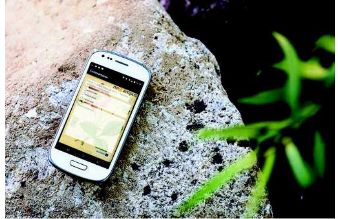
Fig. 3. Illustration of the Biodiversity application. Campus users can help to monitor fauna and flora using their smartphones. Those data help researchers to dress an up to date list of the fauna and flora.

CO2, humidity, etc... see figure 2). This project studies the use of autonomous machine learning systems coupled with the indoor environment quality expertise. This expertise concerns thermal, visual, acoustic comfort, air quality, the impact of occupants behaviours on the thermal performance of buildings, the control and optimization of energy networks, systems and buildings and the thermal and acoustic characterization of materials. The project aims at learning to optimize in real time both the well-being of users and the energy consumption of the classroom.