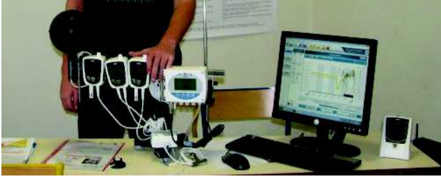
Fig. 2. Monitoring the comfort of users involve to monitor various aspect of the environment such as the temperature, CO2 levels, humidity, etc.

to management, and to the public. This raises the problems of privacy and security, as some data should be anonymized before being shared and not all data should be public. This is why ethical, legal, and safety committees are also involved in the design of our platform.