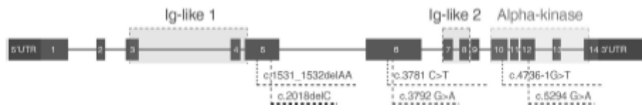
Fig. 3 A schematic representation of the ALPK3 gene. Blue boxes represent exons. Purple boxes represent untranslated regions (3' and 5' UTR). Mutations reported previously are indicated in blue color. Mutation identified in this study is indicated in red color. The three domains—Immunoglobulin-like (Ig-like, red boxes) and Alpha-kinase (green box) domains are also indicated

We report a 3-year-old boy born to consanguineous parents of Tunisian origin and affected with mixed HCM/DCM, dysmorphic features, pectus excavatum, and skeletal deformities of both hands and feet.