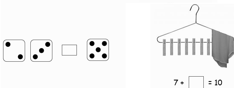
Figure 1: Additive tasks from the Swedish and English textbooks respectively

Figure 1 shows one example from each of the textbooks, Swedish on the left and English on the right. In one of several similar tasks in one exercise, Swedish students were asked to "compare the number of dots" and then "write either = or \neq " in the box. This particular task, which occurred before the introduction of addition, was thought to encourage completion by counting and coded for systematic counting . The expectation that students would address issues of equality or inequality led to its also being coded for quantity discrimination . In addition, the dot patterns not only offered different