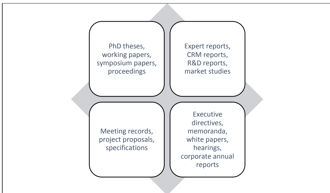
Figure 1: Categories of grey literature (upside research, downside professional; left side academic, right side extra-academic)

Also, the line between academia and non- or extra-academic research is not easy to draw. If extra-academic research is defined as research conducted by professionals, not by scientists, what can we say about the research in library and information sciences conducted by academic librarians and data officers? How do we categorize the results produced by mixed research teams in digital humanities, often composed by scientists (historians, linguists, philologists...), computer experts and engineers? And, finally, how do we deal with the great number of documents based on R&D projects conducted with corporate companies?