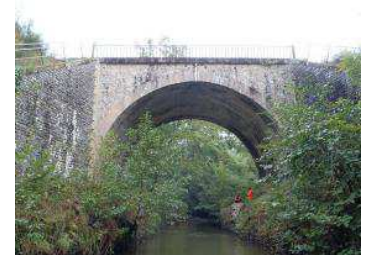
Fig. 2. (Left) Investigated site on the A71 motorway double viaduct next to Orléans (France) over Loire river (one support with its 3 piers). (Right) Railway bridge, investigated site over the Aurence River close to Limoges (France).