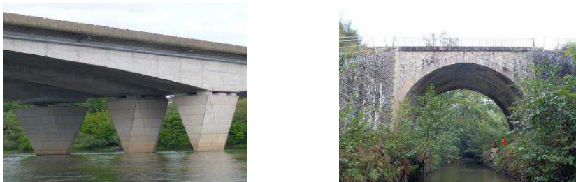
Fig. 2. (Left) Investigated site on the A71 motorway double viaduct next to Orléans (France) over Loire river (one support with its 3 piers). (Right) Railway bridge, investigated site over the Aurence River close to Limoges (France).

The Loire-A71 bridge (Fig.2 (Left)) is a double viaduct. It is representative of structures crossing main rivers in the oceanic part of France. The two decks rests on 6 supports, each one composed by 1 or 2 piers, established into the floodplain. 4 supports are set up in river bed. For this bridge, local scour was observed around 2 supports, n°3 and 4 (Fig. 3). One of these two scour holes will be monitored in real time over one year.