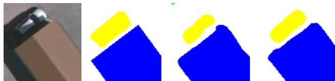
Fig. 2. Results from zoomed area of validation image depicting area 15. (from left to right) the original image, the ground truth, the predictions of SegNet and Stacked Hourglass Networks are shown.

Comparing to SegNet, Stacked Hourglass Networks managed to locate cars with much more detail. In Figure 1, a zoomed region of area 12 and area 4 of the ISPRS testing images is presented as an example. One can observe that the exploited architecture can detect cars even if they are in shadowed places with a very high accuracy. More specifically, for this specific testing area, the overall pixel-wise car accuracy