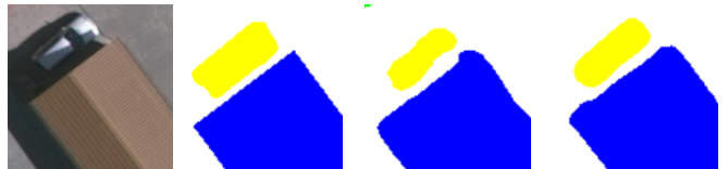
Fig. 2. Results from zoomed area of validation image depicting area 15. (from left to right) the original image, the ground truth, the predictions of SegNet and Stacked Hourglass Networks are shown.

Comparing to SegNet, Stacked Hourglass Networks managed to locate cars with much more detail. In Figure 1, a zoomed region of area 12 and area 4 of the ISPRS testing images is presented as an example. One can observe that the exploited architecture can detect cars even if they are in shadowed places with a very high accuracy. More specifically, for this specific testing area, the overall pixel-wise car accuracy