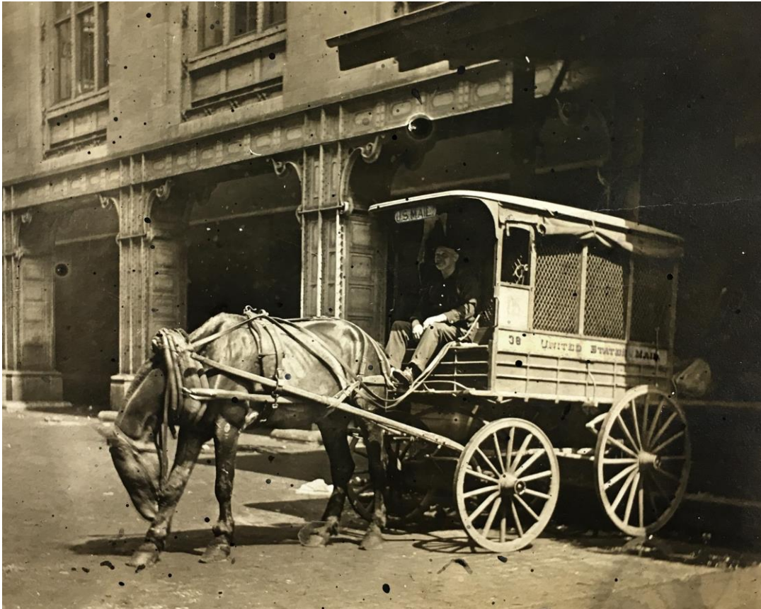
Figure 4: A mail wagon at Grand Central Terminal, 1913. When the pneumatic tube system was first introduced, it delivered mail alongside these slow wagons. This comparison supported the idea that pneumatic tubes made instant connections possible.

technology,” and they never could be on a practical level. Instead, they allowed the mail to be shipped from one hub to another. A person still had to hand-deliver the mail or walk to the postal station to pick up the message. Soon on the heels of the installation of the pneumatic tubes came the automobile, which brought its own notions of speed (though its rapid adoption would create gridlock across Manhattan).