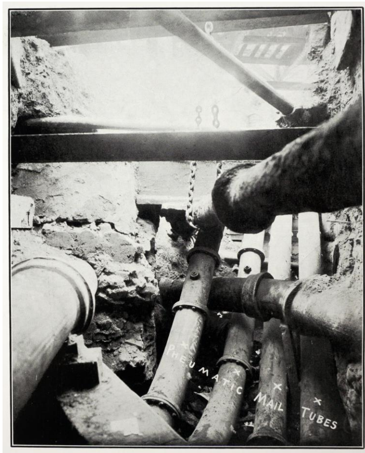
Figure 1: The ganglia of pneumatic tubes beneath the streets in New York City at the intersection of 17 th Street and Sixth Avenue, 1906.

crews digging up the street to lay fiber optic cables between the banks and the stock exchange. Stark was walking home from a tech meet-up in Manhattan. Earlier that evening, a colleague had mentioned to him that New York used to have miles of pneumatic tube lines that shot up to 20,000 letters a minute between Post Offices. On the walk home from the meet-up, as Stark was looking at the heavy machinery digging up the concrete and asphalt, it all seemed like an unnecessary amount of labor and cost – at about $1000 a foot – when the infrastructures were already there just a few feet beneath the hole that was being dug anew (Figure 1). He then envisioned a new business venture: running fiber optic cables in the old pneumatic tubes that were laid in the 1890s. This would allow companies, apartments, and office buildings to get faster Internet connections since the data would have less distance to travel.