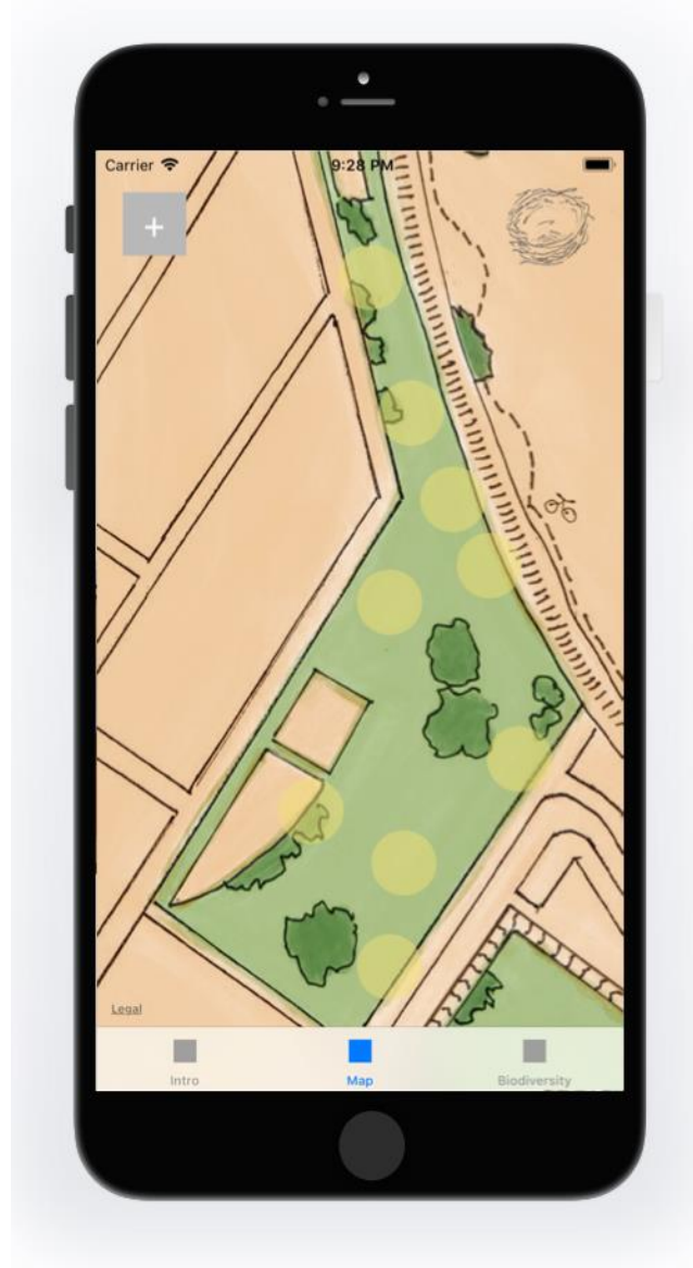
Figure 3: Map interface, Champ de Possibles. Artist, Beverly Didur, designer, Emma Saboureau.

The familiar glowing blue dot (“you are here”) of locative devices appears on the interactive map, and gives users a rough estimation of where they are situated in relation to a series of nine GPS locations, indicated by transparent bubbles. As users approach these geolocations that are tagged by GPS coordinates in the Champ, one of nine thematic icons are “collected” into the nest. Is it a glowing golden key? Or perhaps a buzzing dragonfly has landed? The icons appear by surprise in the nest as the user approaches the GPS location. The icons include things such as plants, an animated butterfly, a ladybug, and lost objects such as a train ticket, a ring, a cross, a key and a button. When touched by the user, the icons reveal a series of related pullouts that