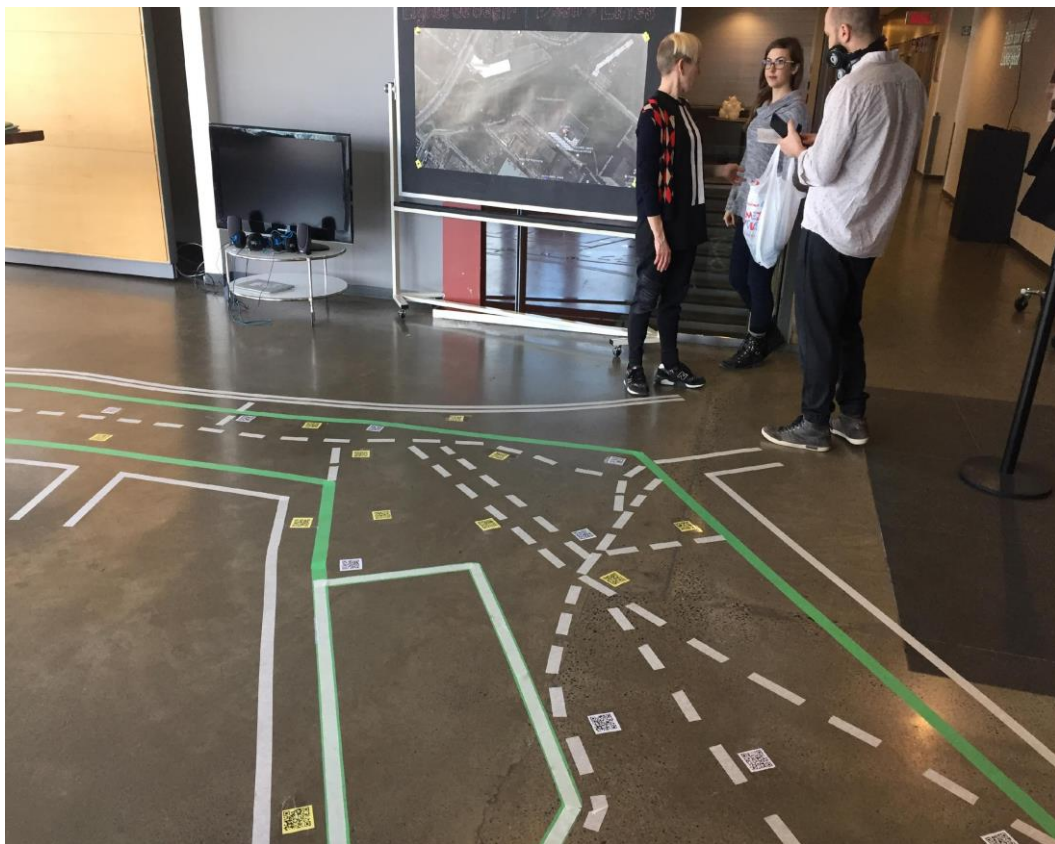
Figure 5 Lignes des désir / Desire Lines--GUV prototype, April 2017.

to roam, the GUV also includes many hidden GPS cues that unlock found sounds and videos that are tied to different seasons and moments of the day in the Champ, adding an element of surprise to the user's palimpsestic experience of the space. Multiple visits to GPS locations provide access to different layers in content, a feature that prioritizes interactivity and keeps the repeated use of the app fresh for frequent visitors. The GUV 's palimpsestic layers include, therefore, alternate models of time, different human histories and activities associated with the space and its edges, as well as what actually lives in the Champ's fields and beneath its very soil.