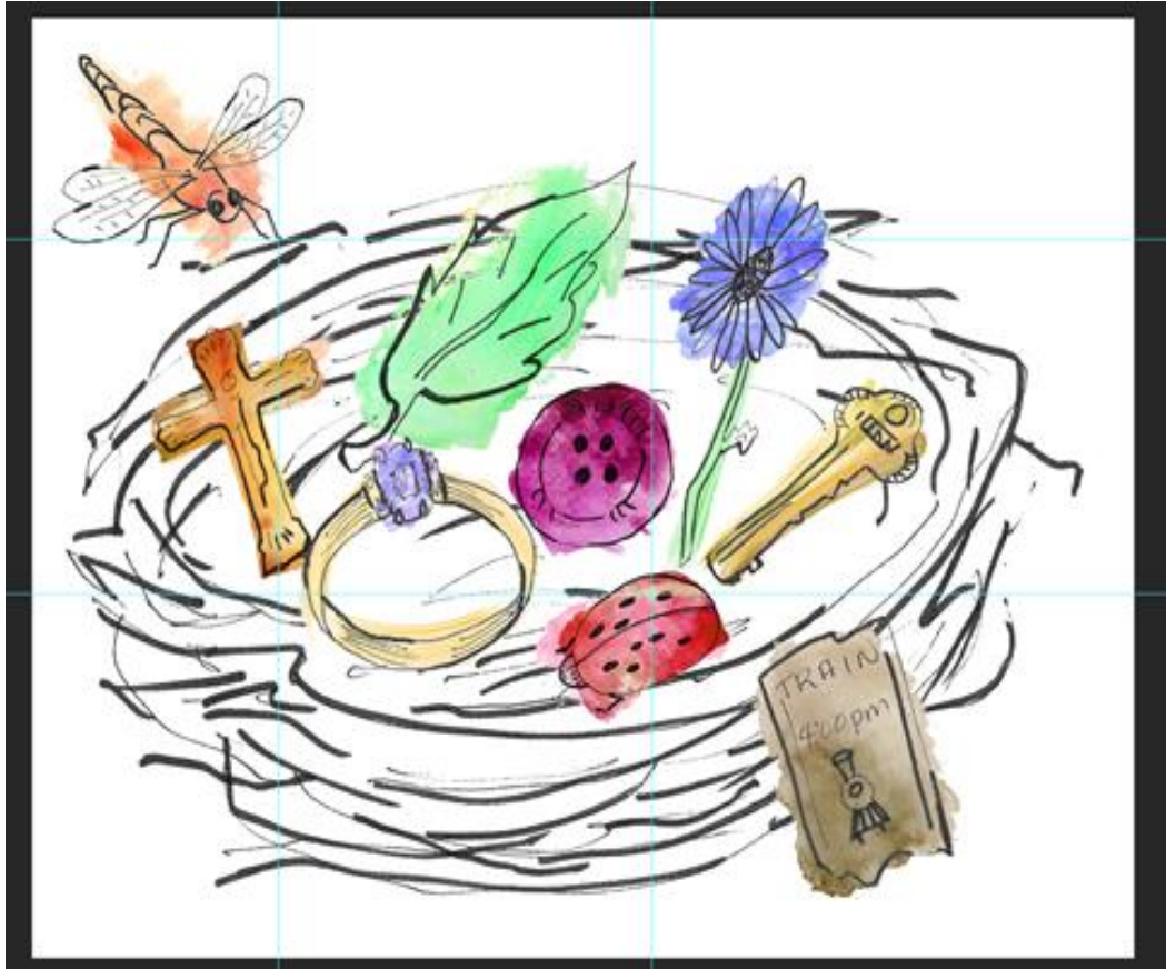
Figure 2: Nest and found icons unlocked by user's proximity to GPS coordinates.

an image that will be slowly overlaid with trinkets (also called “found icons”) associated with the history of human and non-human activities in the Champ (Figure 2).