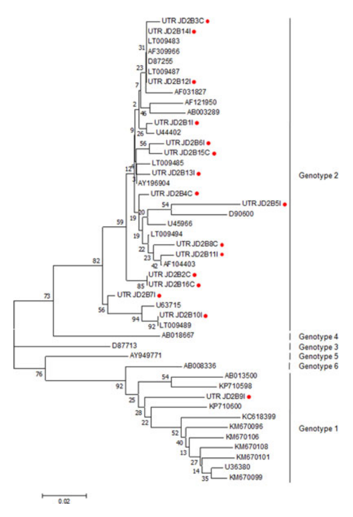
FIGURE 1 UTR phylogenetic tree constructed using HPgV representative isolates and French sequences characterized in this study (red circle). Analysis was done using a p-distance/neighborjoining method; bootstrap values obtained from 1000 replicas are shown. Scale bar indicates the number of substitutions per site

extensions, in combination with deduced NGS contigs, and subsequent characterization of nearly full-length genomes.