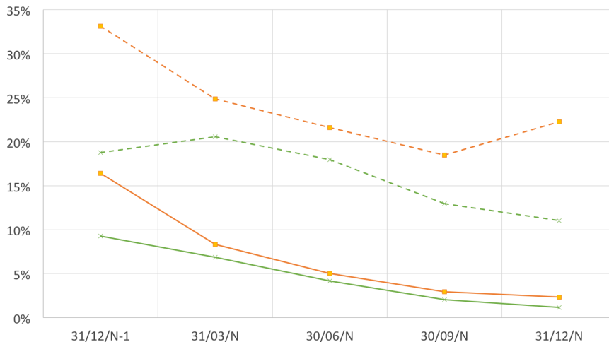
Figure 4: Errors (in %) of Chain Ladder method (lines with square marks) and weighted CART algorithm (lines with cross marks), at different dates of estimation. Solid lines correspond to the ultimate claim amounts, and dotted lines concerns the reserves.