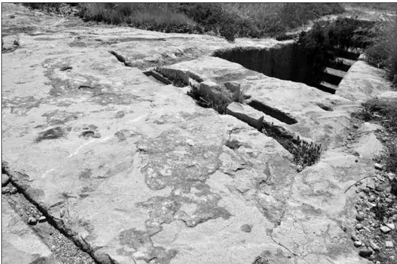
Figure 3. Eastern necropolis, cavities on the rock for the installation of steles and other ritual facilities (April 2014; EFA/Anna Cannavò)

Can we suppose the existence of burial markers of different kinds? Some elements suggest it, for example a Corinthian capital discovered by the Swedish mission in Tomb 2 (Gjerstad et al. 1935: 9), or the column known as the ‘Agucchia’ (or ‘Aiguille’, needle, in Stefano di Lusignano 1573, quoted by Hellmann 1984: 79–80, no. 137), mentioned by several travellers of the 18th and beginning of the 19th centuries and possibly located within the northern necropolis (Hellmann 1984: 79–80, no. 137, 81, no. 142, 82–83, no. 149, 84, no. 152 [and perhaps fig. 30]). These isolated columns, only some elements of which have survived, were possibly funerary monuments of Alexandrian inspiration, characterising the Amathusian funerary landscape in the Hellenistic and Roman periods (Cannavò in press). Among other isolated burial markers, the Swedish mission excavated a unique example of a funerary tumulus , covering an incineration in an alabaster urn, certainly the burial of an Alexandrian official (Tomb 26: Gjerstad et al. 1935: 136–138; Parks 2009: 237).