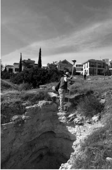
Figure 2. Lionel Fadin geo-referencing Tomb 587, in the Eastern necropolis (April 2014; EFA/Anna Cannavò)

now number 1,258. It is evident, then, that what is available to the general public is only a small part of the archaeological data collected during such a large number of discoveries. The aim of the GIS is not to publish all these tombs, but to collect the information concerning their location and chronology, in order to integrate them into the general cartography of the town. Thanks to the collaboration of the Department of Antiquities, it was possible in 2015 to study a considerable number of the archival documents kept at the Cyprus Museum in Nicosia.