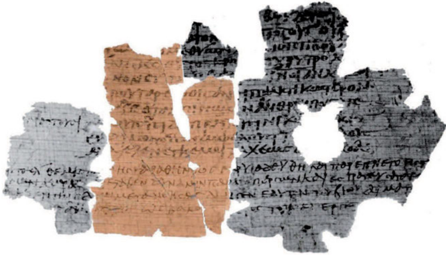
Fig. 3: A sheet from a copy of Aristophanes' Knights : the black-and-white fragments are in Oxford, the colour one in Paris (From CLGP Pars I , vol. 1, fasc. 4, tab. II).

information about the copyist, date and context of the copy; 47 they had no ex-libris or bookplates that would have allowed us to know the owner.