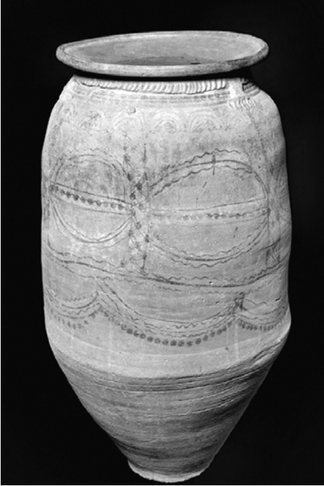
Fig. 1: The jar in which the Archive of Papas was discovered.

(d) Obsolete archives might also be simply discarded: they ended up in garbage dumps (public or private), more or less scattered or mixed. The way they were excavated did not help matters: in the past, dumps were often excavated without respecting their stratigraphy: ‘one attacked the mound laterally, caused slices of it to fall one by one, and sorted out the papyri after each “landslide” instead of ‘removing the layers separately, which demands a high degree of concentration when they cross over or under each other’. 30 When excavating dumps in the Eastern Desert fortresses, we were able to distinguish mini-archives of ostraca corresponding to the contents of the basket with which the soldier discarded documents which had accumulated in his room when he wanted to clean it. 31