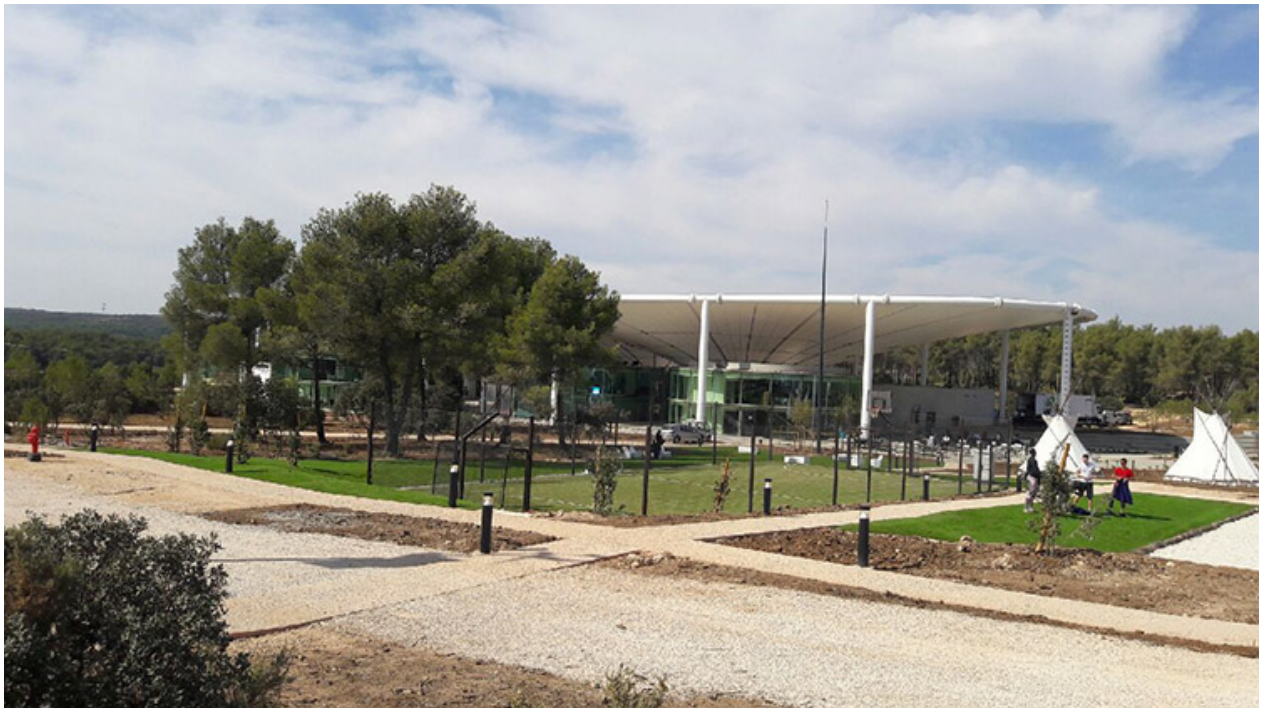
7-hectare site facing the Mont Sainte-Victoire.

A major objective of my immersion in thecamp is to measure the methods, the socio-spatial and functional configurations of this ecosystem, to identify its capacity to generate disruptive innovations. From September 2017, I observed collaborative sessions as well as productions of The Hive, the international creativity residence of Aix-en-Provence innovation campus (France) and interviewed the Hivers (Makery visited it before its opening).