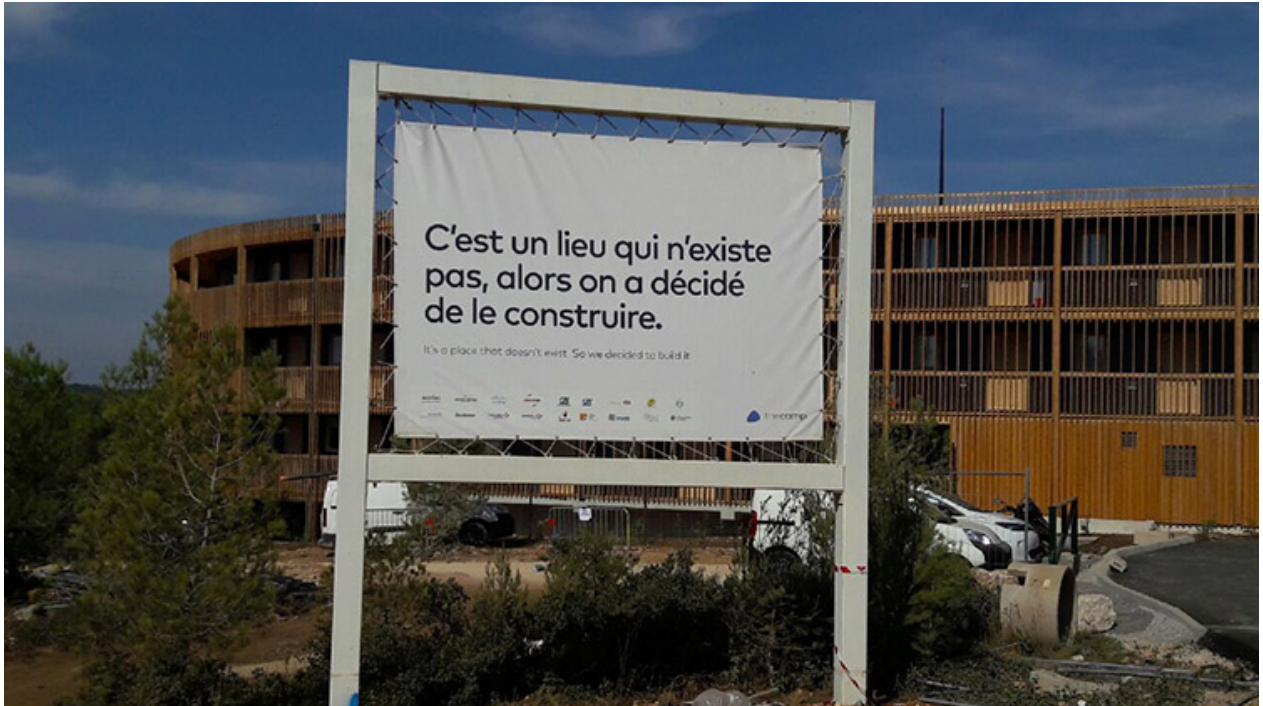
On this billboard: "This is a space that doesn't exist, so we decided to make it".