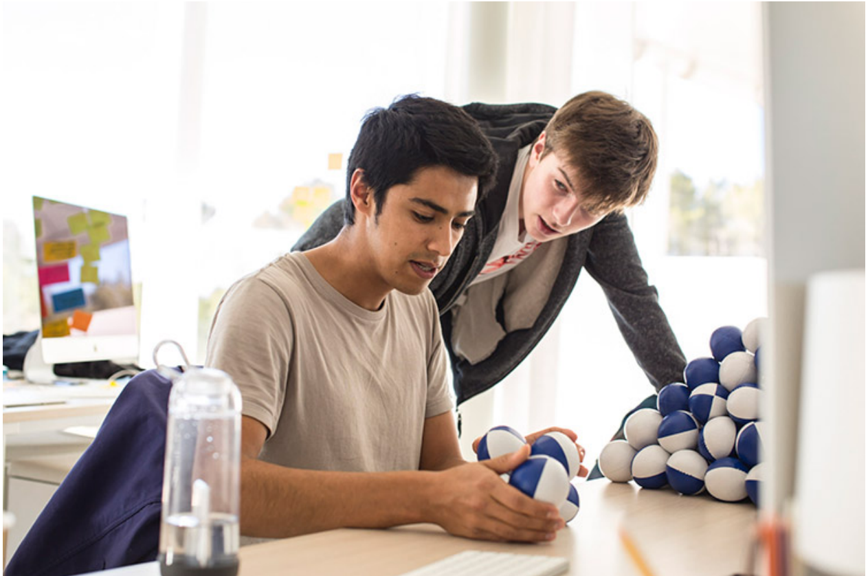
Hivers» into a design thinking exercise.

These different situations sideline a purely ideal conception of knowledge, by defending one that is equally material, experimental and experiential. Prototyping tools, VR technologies, methods of design thinking or of design fiction produce new narratives and realities, which permit exploring the future and re-questioning certainties from disjointed viewpoints. At the heart of thecamp, knowledge is also the “art of doing”. This, is the total reason for the residence The Hive, which enables twenty talents from the world over (hackers, coders, fab managers, designers, graphic facilitators, engineers, innovation managers, ...), to open new creative paths for researchers as well as public et private leaders, by offering «a disruptive view of the world ». The Hive is reminiscent of other art-science residences, which have developed these last years within the Massachusetts Institute of Technology (MIT) in Boston, the A10lab in London, the Medialab Prado in Madrid, or the art-science workshop in Grenoble.