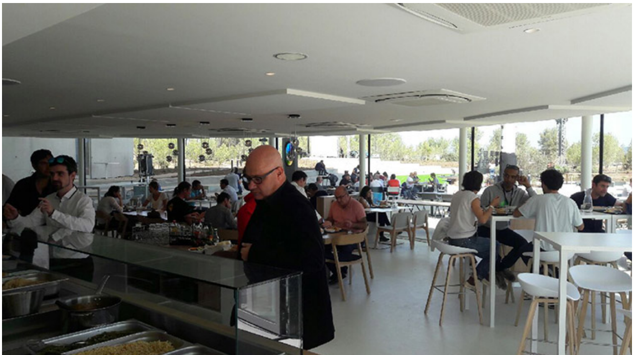
At the restaurant, only vegetarian menu is available.