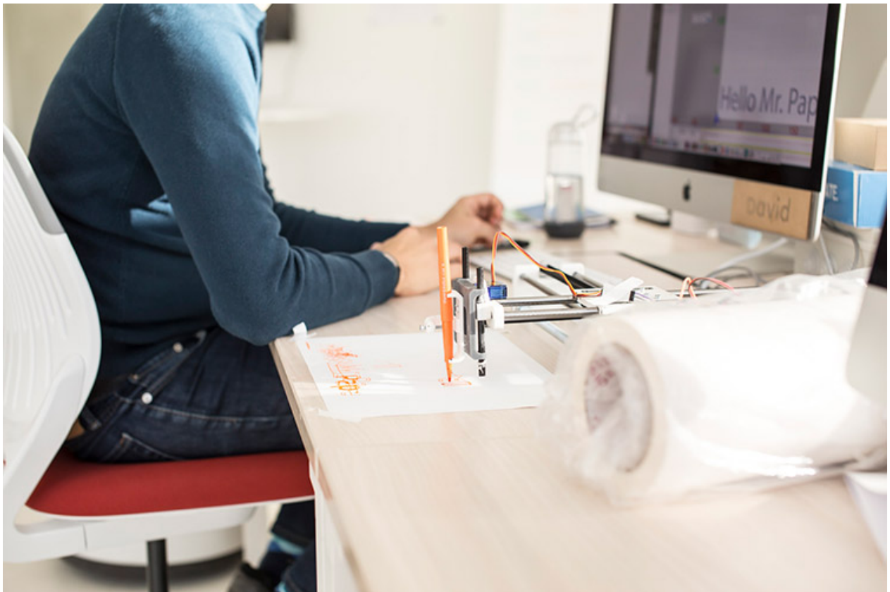
The Hive is not directly profitable: The Hivers are lodged and compensated for six months.

This innovation campus itself falls under a calculated economical logic. Its initial cost is considerable, situated around €80 million: €40 million for the buildings and €40 million for the first years of operation. Frédéric Chevalier personally invested €12 million Euros in the project. Thecamp has over 60 salaried employees and programs like The Hive are not directly profitable: (The Hivers are lodged and compensated for six months). Then, because thecamp is registered as a public-private entity associating community organisations, it has a wide partnership base (including the Crédit Agricole Alpes-Provence Bank, the Deposit and Loan Fund, Sodexo, Vinci...). Other financial resources will come to complete this economic model with start-up incubation (thecamp will withdraw de 3 to 5% of the capital), international acceleration and development of young businesses, creative workshops or training sessions.