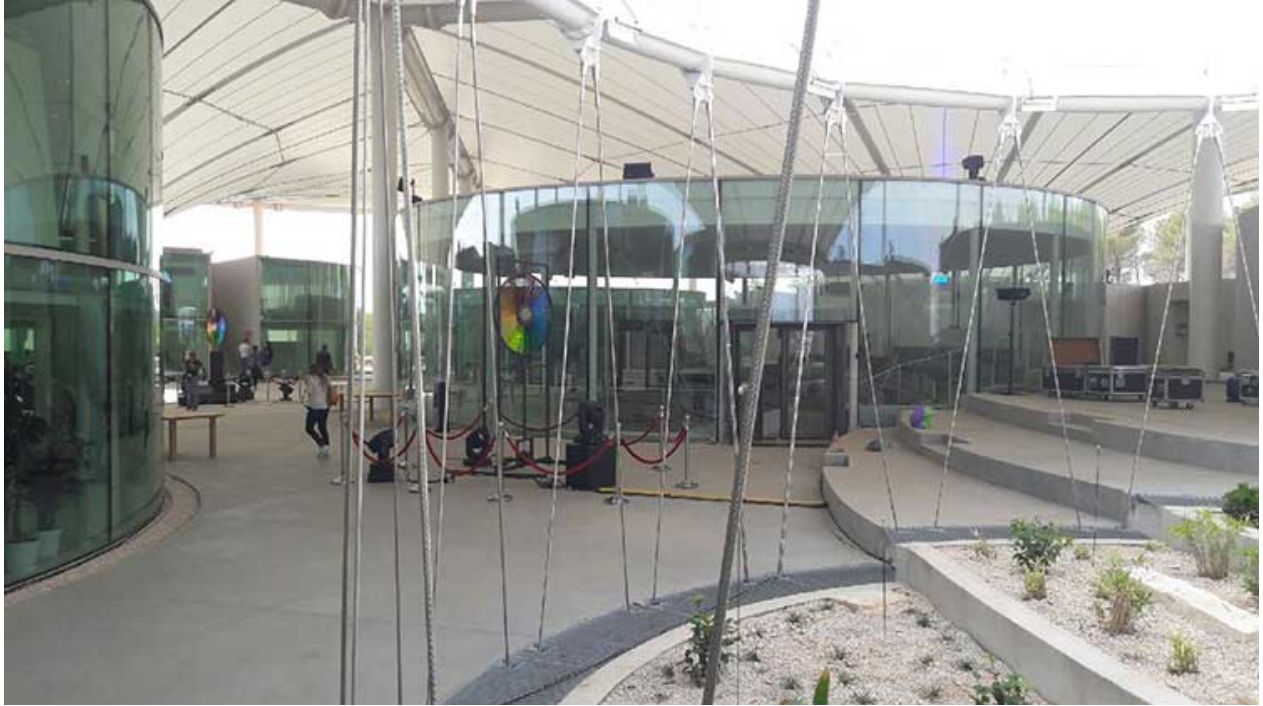
Thecamp is based on an aesthetic of openness.

Particularly: that sciences and innovations are especially the result of scientists and inventors objectively thinking while isolated and separated from any social life; that innovations are only intellectual and conceptual affairs in so much as knowhow, traditional uses of materials, craftsmanship or artistic practices would be unable to play a decisive role; that the expansion of sciences and discoveries could not be fundamentally associated with commerce and the business world; that the generalised development of digital technologies would necessarily lead to closure of spaces devoted to knowledge and to innovation.