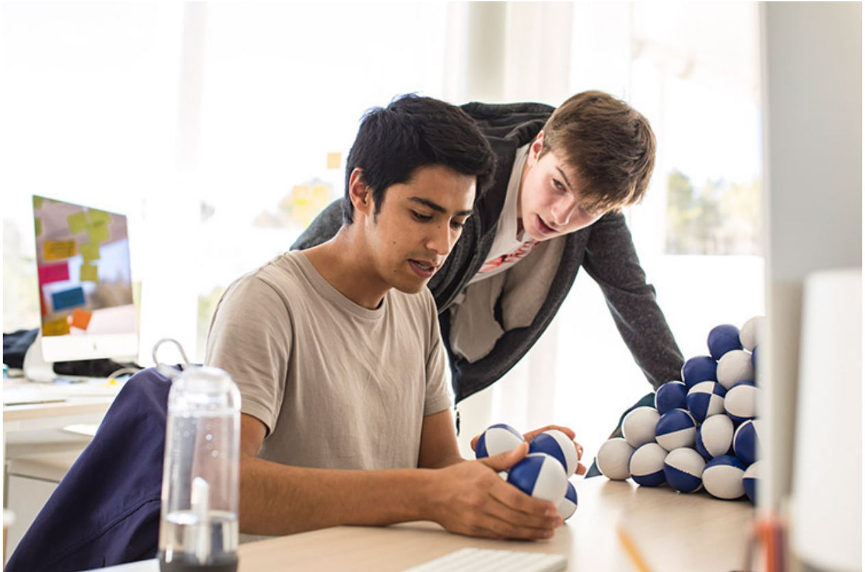
Hivers» into a design thinking exercise.

These different situations sideline a purely ideal conception of knowledge, by defending one that is equally material, experimental and experiential. Prototyping tools, VR technologies, methods of design thinking or of design fiction produce new narratives and realities, which permit exploring the future and re-questioning certainties from disjointed viewpoints. At the heart of thecamp, knowledge is also the “art of doing”. This, is the total reason for the residence The Hive, which enables twenty talents from the world over (hackers, coders, fab managers, designers, graphic facilitators, engineers, innovation managers, ...), to open new creative paths for researchers as well as public et private leaders, by offering «a disruptive view of the world ». The Hive is reminiscent of other art-science residences, which have developed these last years within the Massachusetts Institute of Technology (MIT) in Boston, the A10lab in London, the Medialab Prado in Madrid, or the art-science workshop in Grenoble.