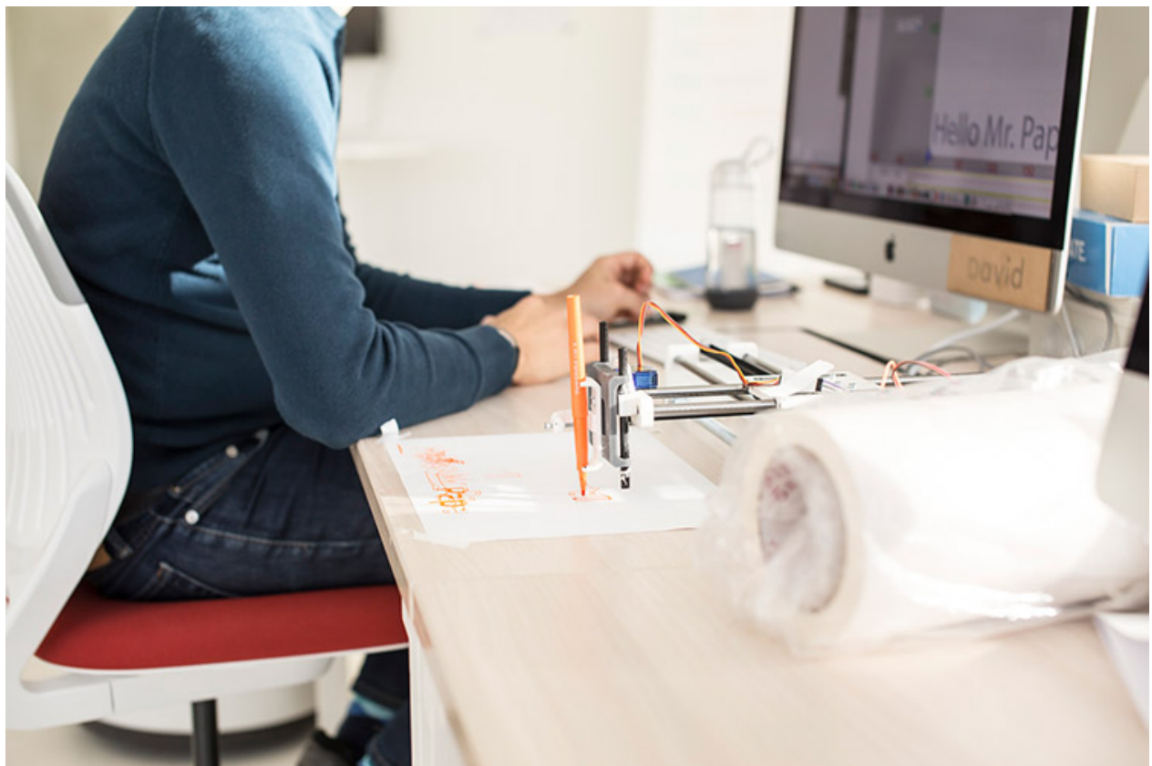
The Hive is not directly profitable: The Hivers are lodged and compensated for six months.

This innovation campus itself falls under a calculated economical logic. Its initial cost is considerable, situated around €80 million: €40 million for the buildings and €40 million for the first years of operation. Frédéric Chevalier personally invested €12 million Euros in the project. Thecamp has over 60 salaried employees and programs like The Hive are not directly profitable: (The Hivers are lodged and compensated for six months). Then, because thecamp is registered as a public-private entity associating community organisations, it has a wide partnership base (including the Crédit Agricole Alpes-Provence Bank, the Deposit and Loan Fund, Sodexo, Vinci...). Other financial resources will come to complete this economic model with start-up incubation (thecamp will withdraw de 3 to 5% of the capital), international acceleration and development of young businesses, creative workshops or training sessions.