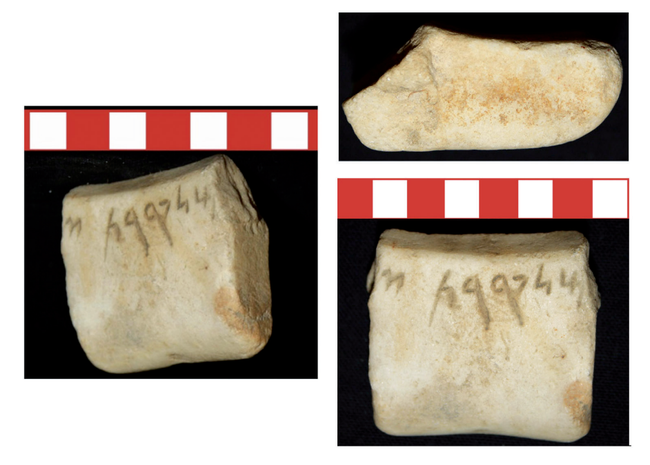
Fig. 1: Marble lug with Phoenician inscription. Collezione Cesnola, Museo di Antropologia ed Etnografia, Università di Torino

It is a marble stone fragment of small size with veins of orange-brown. The object, described in the mentioned inventory as "placca marmorea con breve epi-