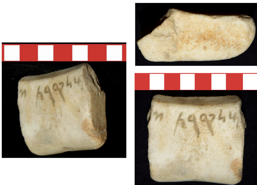
Fig. 1: Marble lug with Phoenician inscription. Collezione Cesnola, Museo di Antropologia ed Etnografia, Università di Torino

It is a marble stone fragment of small size with veins of orange-brown. The object, described in the mentioned inventory as “ placca marmorea con breve epi-