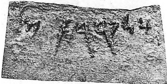
Fig. 3: Colonna Ceccaldi's squeeze of CIS I 26 (after CIS I, pl. VII, 26)