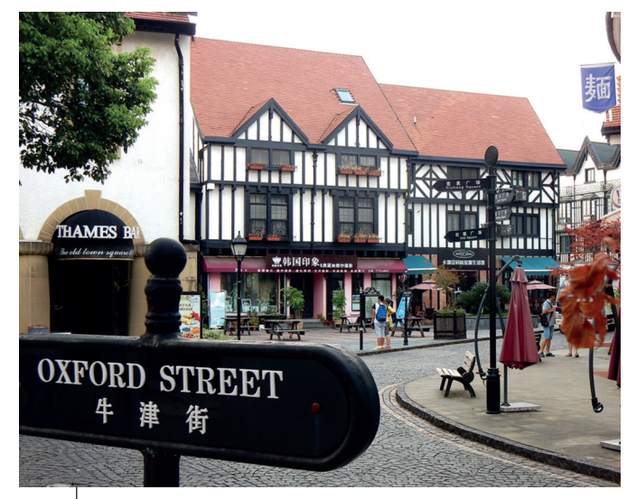
Photo 1 – The "historic" centre of Thames Town in August 2016.

Unlike the other operations in the Songjiang English-style sector such as British Manor, Red Villa, Shanghai Class, and Rose Bush, whose buildings are homogenous, attention to detail has been taken to an extreme in Thames Town. The juxtaposition of homes inspired by different historical periods, architectural styles, shapes, and sizes (bow windows), building techniques, and materials (timber frames, red and grey bricks, and rendering) tends to create an impression of eclecticism. Three different eras are suggested in the public spaces of Thames Town: the historic centre round the Neo-Gothic church and Love Square imitate classical Georgian and Victorian style; the northern side of Holiday Square, encircled by buildings in red and grey brick represents the industrial revolution; and lastly, the semi-circular Municipal Square is bordered by contemporary façades, setting the stage and leading the eye towards the new city beyond Lake Huating. The development has been designed to evoke the historic development of an English town. (24)