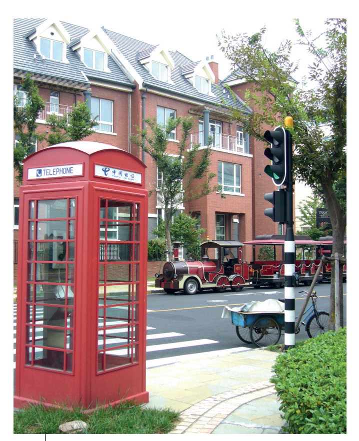
Photo 2 – An English cliché in the suburbs of Shanghai in August 2007.

For the district of Songjiang and the New City Development Corporation, Thames Town was a showcase project designed to stimulate the interest of property developers and individuals, and therefore maximise the rise in land values when land use rights are sold. It is therefore an urban production characteristic of the golden age of urban development in China. Is Thames Town characteristic of a Chinese gated community ?