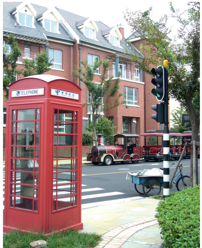
Photo 2 – An English cliché in the suburbs of Shanghai in August 2007.

For the district of Songjiang and the New City Development Corporation, Thames Town was a showcase project designed to stimulate the interest of property developers and individuals, and therefore maximise the rise in land values when land use rights are sold. It is therefore an urban production characteristic of the golden age of urban development in China. Is Thames Town characteristic of a Chinese gated community ?