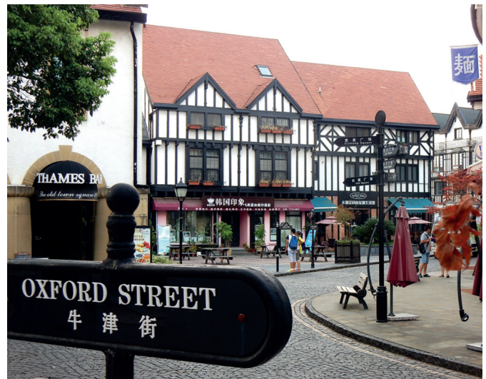
Photo 1 – The "historic" centre of Thames Town in August 2016.

Unlike the other operations in the Songjiang English-style sector such as British Manor, Red Villa, Shanghai Class, and Rose Bush, whose buildings are homogenous, attention to detail has been taken to an extreme in Thames Town. The juxtaposition of homes inspired by different historical periods, architectural styles, shapes, and sizes (bow windows), building techniques, and materials (timber frames, red and grey bricks, and rendering) tends to create an impression of eclecticism. Three different eras are suggested in the public spaces of Thames Town: the historic centre round the Neo-Gothic church and Love Square imitate classical Georgian and Victorian style; the northern side of Holiday Square, encircled by buildings in red and grey brick represents the industrial revolution; and lastly, the semi-circular Municipal Square is bordered by contemporary façades, setting the stage and leading the eye towards the new city beyond Lake Huating. The development has been designed to evoke the historic development of an English town. (24)