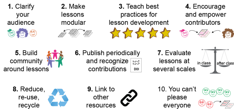
Fig 1. Graphical abstract of 10 simple rules for collaborative lesson development. 1. To clarify your audience, consider writing learner profiles (Box 1). 2. Make lessons modular by breaking them into small, single-purpose modules. 3. Teach your instructors the best practices for developing, delivering, and maintaining lessons. 4. Encourage and empower contributors by making the contribution process transparent and straightforward. 5. Build a community around lessons by creating opportunities for participation and mentorship. 6. Publish new versions periodically and recognize contributors by their unique identifiers (e.g., ORCID). 7. Evaluate lessons during and after class for a complete picture of their efficacy. 8. Reduce, reuse, or recycle lessons before creating a new one from scratch. 9. Link to other resources that complement the lesson content. 10. Remember that you can't please everyone in your audience or community.

https://doi.org/10.1371/journal.pcbi.1005963.g001