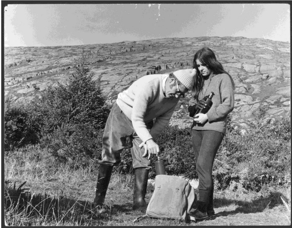
Figure 2: Lovelock and his daughter collecting air samples in the summer of 1970, County Cork. These measures of air composition were but one among many he carried out in the early 1970's in connection with the Gaia hypothesis.

This quick overview enables us to acknowledge that Lovelock was not a philosopher or a poet trying to resurrect a romantic view of nature. He was not even a theoretician, but a chemist and engineer, with a hard core ethos of a practical scientist. His problems and arguments, he did not find in books 22 , but in the chemical compounds