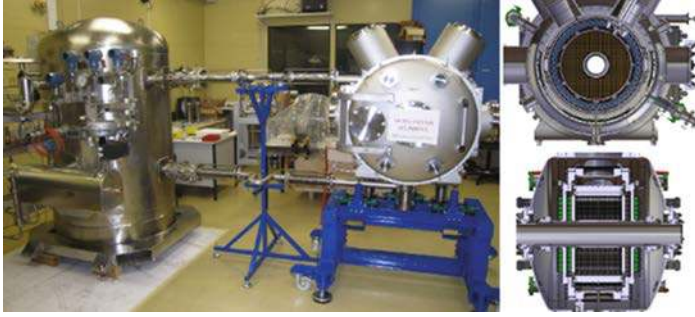
Fig. 2. XEMIS2 camera with ReStoX

and SUBATECH collaboration. It could store 210 kg xenon from room temperature to liquid xenon temperature ( \sim -100 °C). In addition, the xenon cooling with liquid nitrogen is very powerful, up to 10 kW. The commissioning of ReStoX has been done in our laboratory. Results have shown that, for 200 kg LXe, without cooling source, the room temperature would be reached from LXe temperature in almost 1 year. And in case of extreme situation, a passive recovery with the gravity could be realized in almost 10 min.