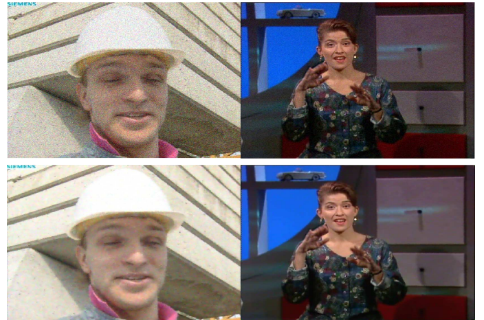
Fig. 3: Example of input degraded images (top) and associated restored images (bottom) for Foreman (left) and Irene (right) sequences.