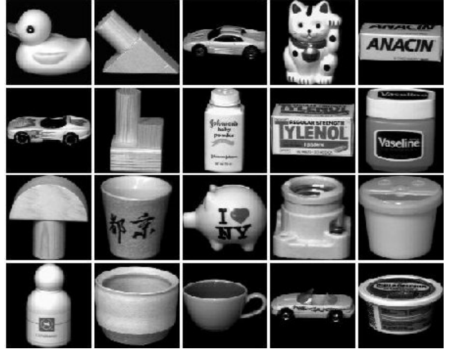
Fig. 1. Samples from COIL20

We have compared our work with two recent studies in clustering. The first one is deep subspace clustering (DSC) [7] and the second one is orthogonal matching pursuit based sparse subspace clustering (OMP) [8]. We also compare with the piecemeal technique where features are first extracted by transform learning and then subjected to LLMC.