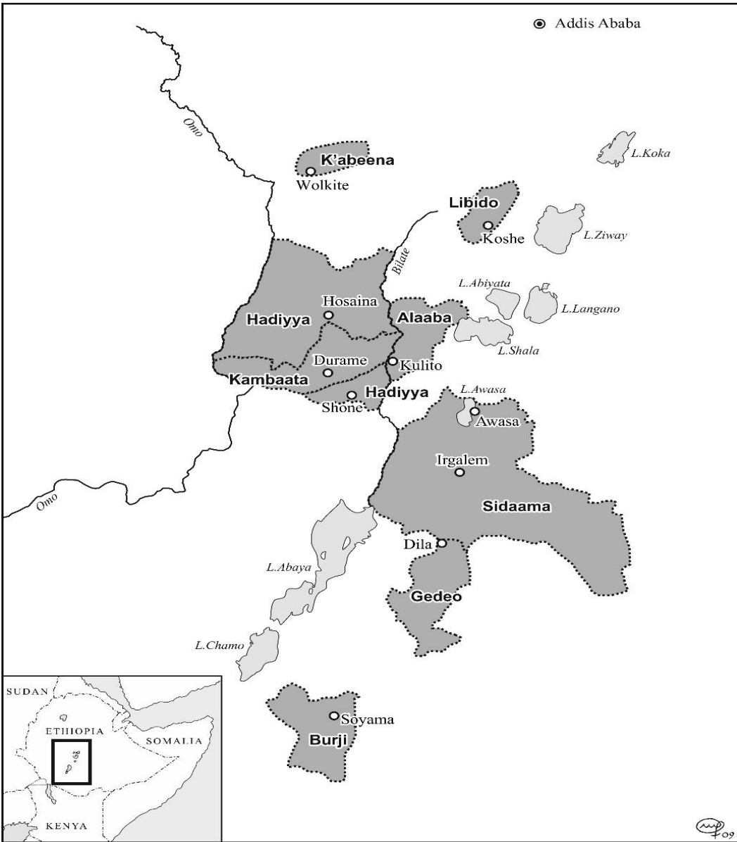
Figure 2. Highland East Cushitic languages 28

This section investigates whether Kambaata and its closest relatives carve up the semantic field of temperature in a similar way and whether they share cognate temperature lexemes. We concentrate on domain-central temperature terms and on the tactile and ambient frame of evaluation, because the available sources, i.e. entries in word lists and dictionaries as well as examples in grammars and text collections, contain no information on personal-feeling temperature. In order to allow for an easier comparison of the cognates, only bare lexical roots without derivational and inflectional morphology are given in Table 13.