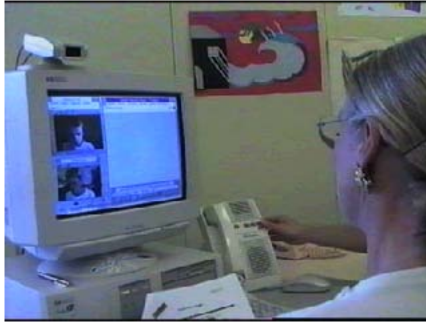
Fig. The TéléCabri experimental platform at the Grenoble Academic Hospital.