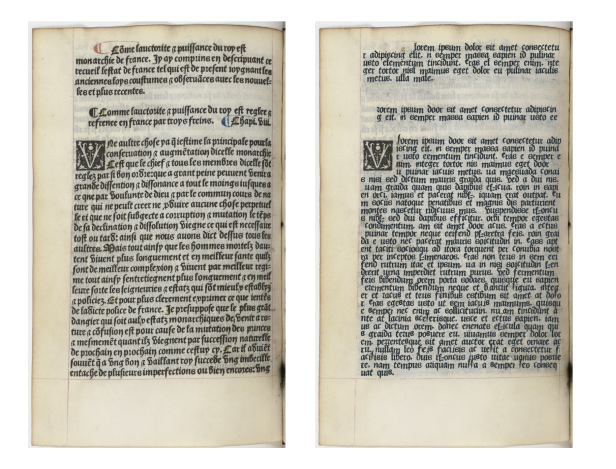
Fig. 1. An original ancient document image (left) and its synthetic version created using the font, background and layout of the original image. The text has been replaced by Lorem Ipsum. During the font extraction process, several instances of each character are extracted. Thus, when the font is used to write a character, DocCreator will randomly choose an image among different versions. This will make the final output look more realistic by reducing the strict uniformity between similar letters. A font extracted by the user can be used later to compose a new document

Second possibility: a researcher has a groundtruthed database but it is too small or not heterogeneous enough. DocCreator provides several degradation algorithms to augment the dataset. By degrading text ink, paper shape or background colors it is possible to create a representative document image database where many defects are present. This complete database is finally useful for precise performance evaluation or to provide multiple cases for retraining processes (in algorithms embedding a learning step).