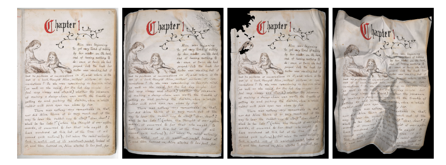
(b) 3D deformation: an original image and three 3D deformations