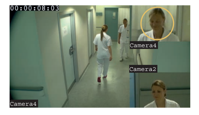
Figure 13: Excerpt 6, 08:03.