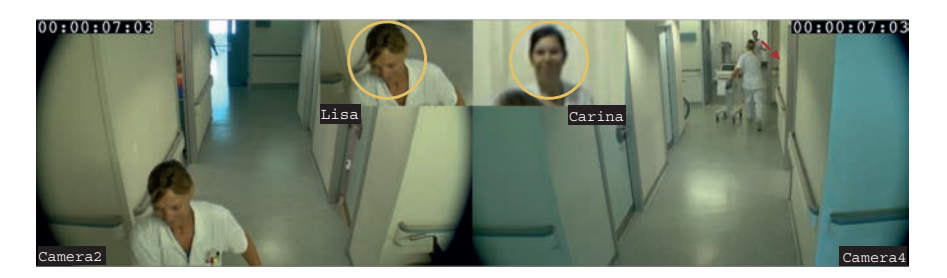
Figure 17: Excerpt 7, 07:03.