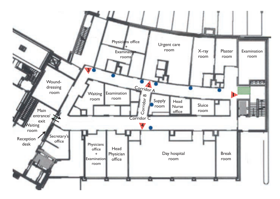
Figure 1: Clinic premises and recording set-up. The triangles represent the video cameras, the dots the wireless microphones, and the striped rectangle the reception/mixing/editing station. Corridor A is 27.40 meters long, Corridor B (the section between Corridors A and C) 4.16 meters long, and Corridor C 31.50 meters long.

walk around and enter and exit the adjacent rooms, as well as activities in the entrance area of the day hospital and the urgent care room. The video recordings captured by the four cameras were synchronized with each other as well as with the audio recordings in Final Cut Pro® multi-cam files. The resulting data makes it possible to track participants as they move from one place to another in the clinic. With respect to the images, we can examine a single development from different perspectives by switching camera angles. With respect to the sound, we can ensure that we clearly hear whatever the participants may be saying as they walk down the corridors by switching between the audio tracks corresponding to the various microphones installed at different points along their way. Switching between audio tracks also allows us to grasp how something said in one part of the clinic could be heard in another.