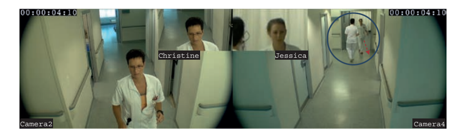
Figure 24: Excerpt 8, 04:10.