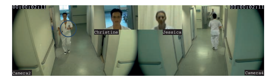
Figure 22: Excerpt 8, 02:11.