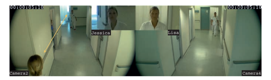
Figure 9: Excerpt 6, 05:10.