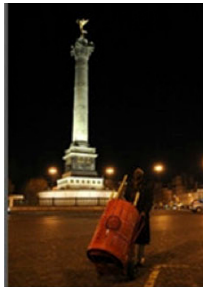
Fig. 7: Christian Bertin performing Diab-la in Berlin.

The results of métissages and creolizations are nonetheless bound to melt their actual essences into new normalities, leaving untouched but the process itself, which is a source of quiproquos and aesthetic pleasures, where the consideration of the other oozes through like an aroma in a complex elixir. (Glissant, 2007: 49-50, transl. F. Lefrançois)