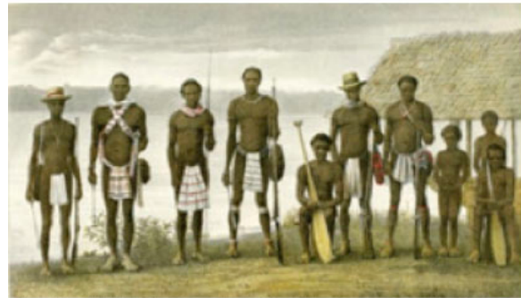
Fig. 3: A.M. Coster, De Boschnegers in de Kolonie Suriname , watercolour, 1866.

The shame and guilt secretly nurtured by the reception of the colonial other's production are consubstantial with the abnormality of imperial exaggerations. On the interpersonal level as well as on the macro-structural scale, realities are much more complex than they seem. Easy caricatures or stereotypes are but means of eluding the question of interdependency. When Napoleonic France lost the colony of Santo Domingo, the French emperor reacted like a spoilt child looking forward to take his revenge upon a bad nourrice . Before the independence of Haiti, France had been milked by its colony. It would be a spurious argument to state of the two counterparts the most dependent was not the metropolis.