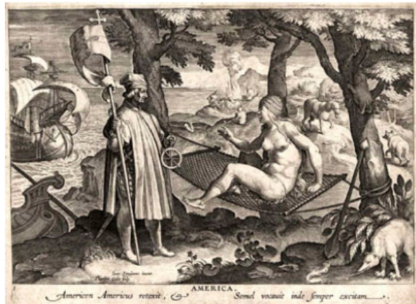
Fig. 1: Jan Van Der Straet, America , ink on paper, 200 x 269 mm, British Museum.

America is pregnant with a powerful scenography. Its dramatic expressivity relies on a masterful use of spatial contrast and