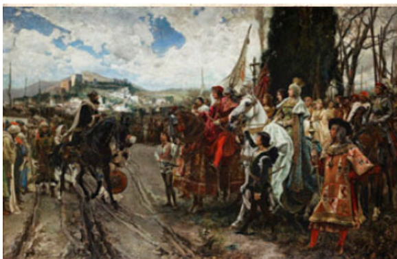
Fig. 2: Francisco Pradilla Ortiz, The Capitulation of Granada , oil on canvas, 330 x 550 cm, 1881, Palace of the Senate, Spain.

The appeal of revenge, conquest and possession must find an innocent scapegoat to be satisfied. And there she is: the strong, almost man-like America who just sprung from her hammock hardly has time to realize what is happening to her. She was asleep. From now on, in compliance with the diktat of novelty and productivity, she will become the stage of a Sisyphean coloniality that never sleeps.