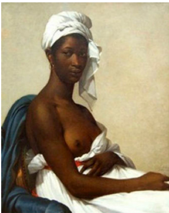
Fig. 4: Marie-Guillemine Benoist, Portrait d'une négresse , oil on canvas, 81x 65 cm, 1800.

race ont certes été proclamés sous la Révolution mais ne seront assimilés que progressivement. A cette époque, les distinctions raciales sont minutieusement décrites et rationalisées. En parallèle, avec l'extension de l'esclavage au XVIIIe siècle s'est développée une hiérarchie des races fondée sur une classification des caractéristiques biologiques. En 1800, si la loi rejette encore moralement la race, la différenciation l'emporte. (Albigès, 2007)