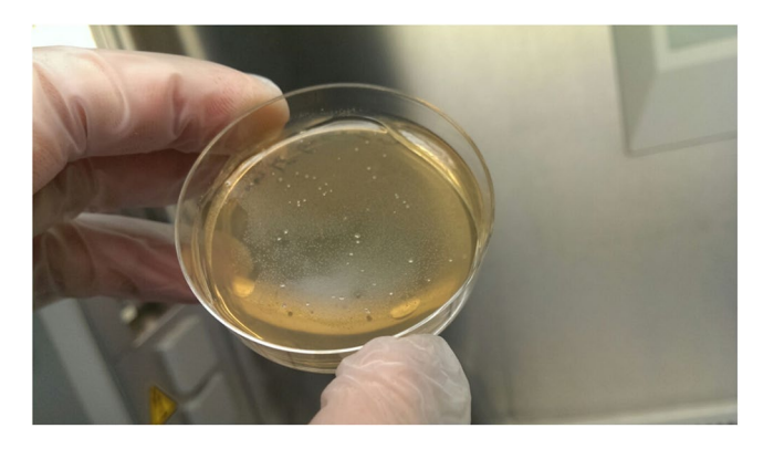
Figure 2. M. oralis (pale colonies forming a film) and M. smithii (white colonies) isolates from an oral fluid specimen collected in a tabacco-smoking individual.